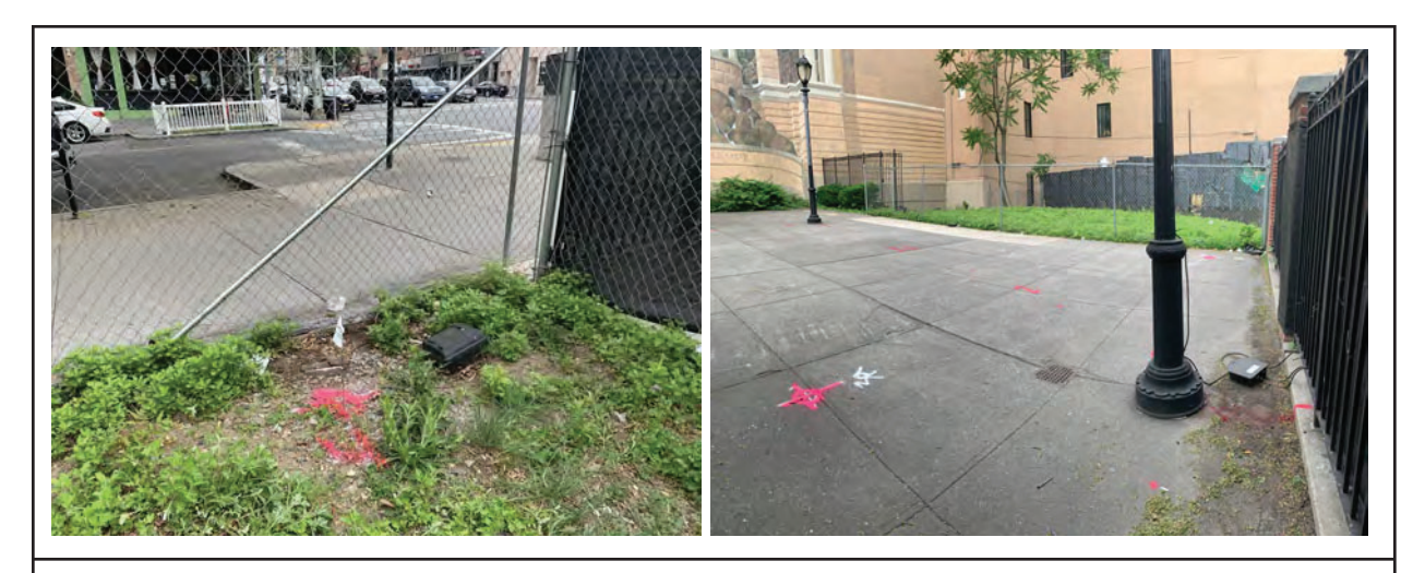
Fig. 1: Images of the client's proposed boring locations investigated.