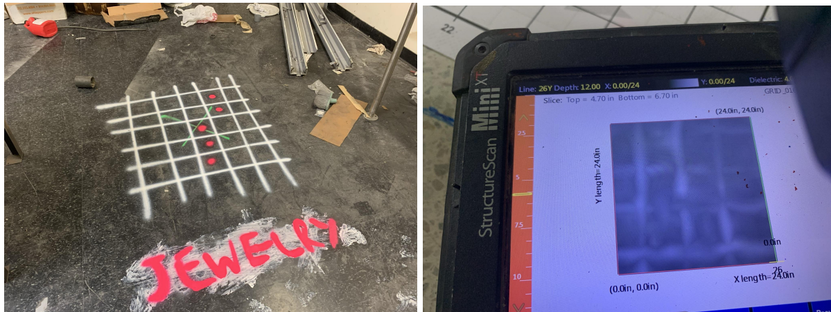
Fig. 1: Images of the interior locations investigated.