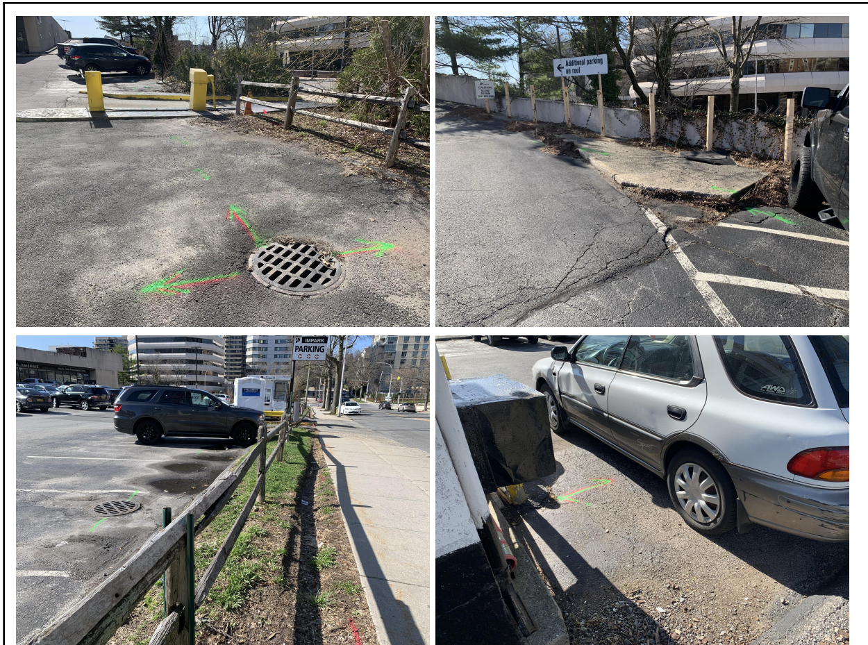
Fig. 4: Images of the storm sewer investigated/detected.