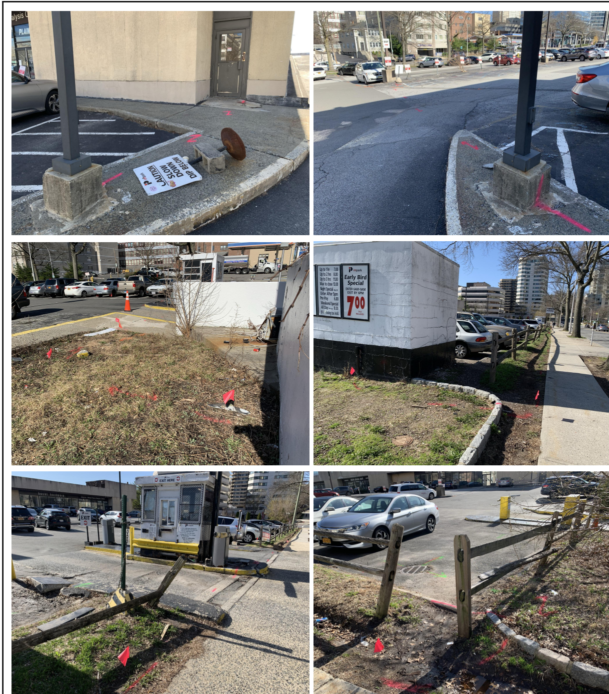
Fig. 2: Images of the electric detected around the parking lot.