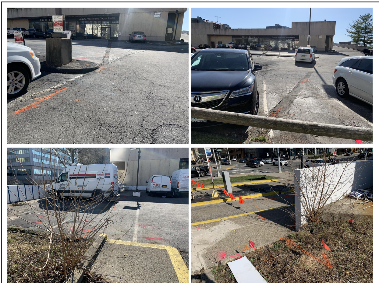
Fig. 3: Images of the two communications trenches detected.