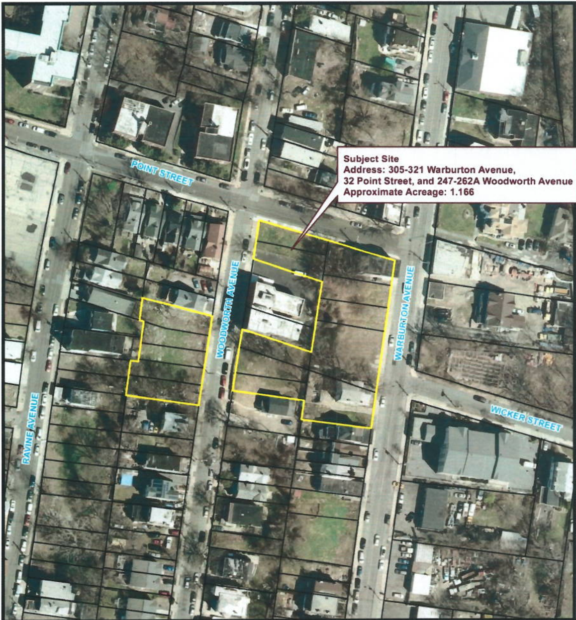
EXHIBIT A SITE MAP

Subject Site Address: 305-321 Warburton Avenue, 32 Point Street, and 247-262A Woodworth Avenue Approximate Acreage: 1.166