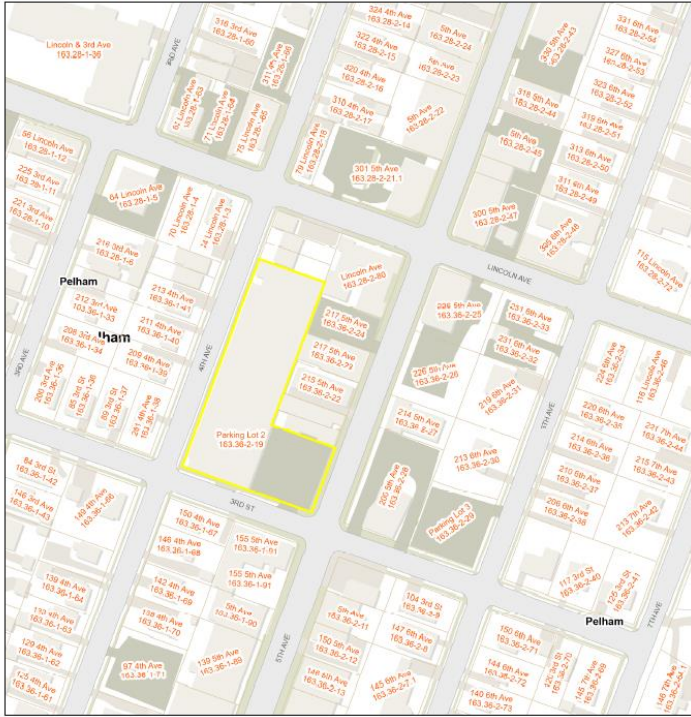
Figure 2 - Lot 163.36-2-19 (Pelham)