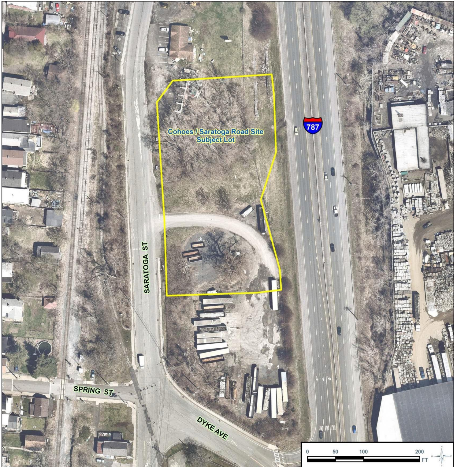
Site Location Map