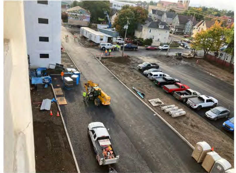
2022-10-07 08:45 42.1156306 N , 75.9522083 W Aerial view of Helen Drive and eastern portion of southwestern parking lot, looking southeast