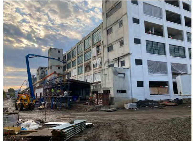
2022-10-07 08:36 42.1161611 N , 75.9530417 W Status of site work, northwestern section of Avenue C, looking east