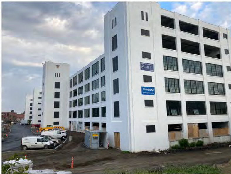
2022-10-07 08:24 42.1150889 N , 75.9503028 W Status of site work, eastern end of Helen Drive and Avenue C, looking west