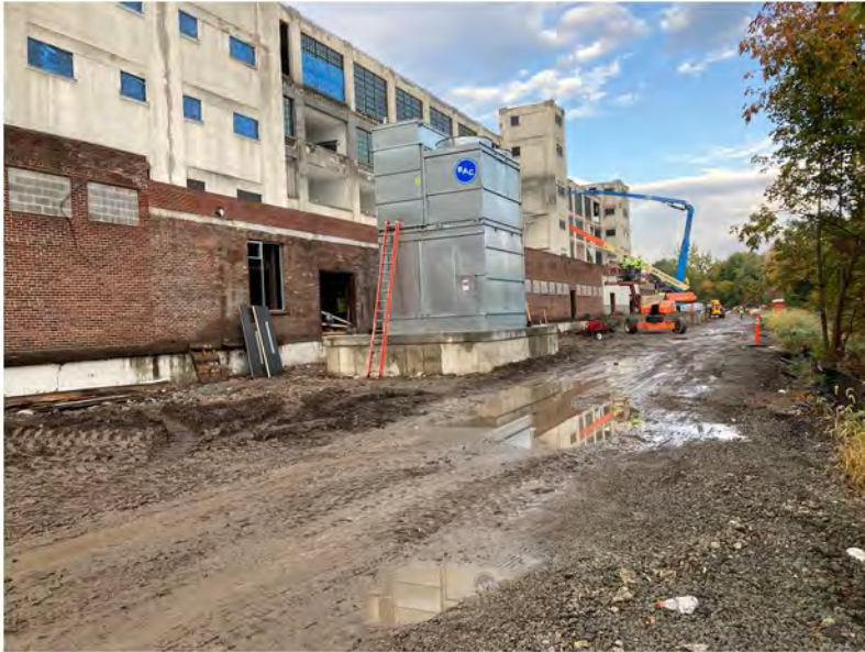
2022-10-07 08:34 42.1158361 N , 75.9513556 W Status of site work, northeastern section of Avenue C, looking west