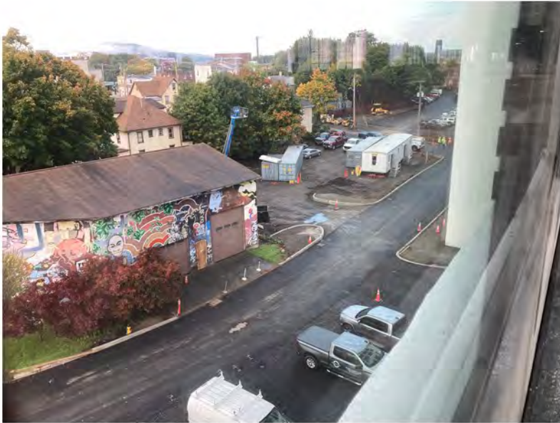
2022-10-07 08:51 42.1153417 N , 75.9505917 W Aerial view of eastern portion of Helen Drive, looking southwest