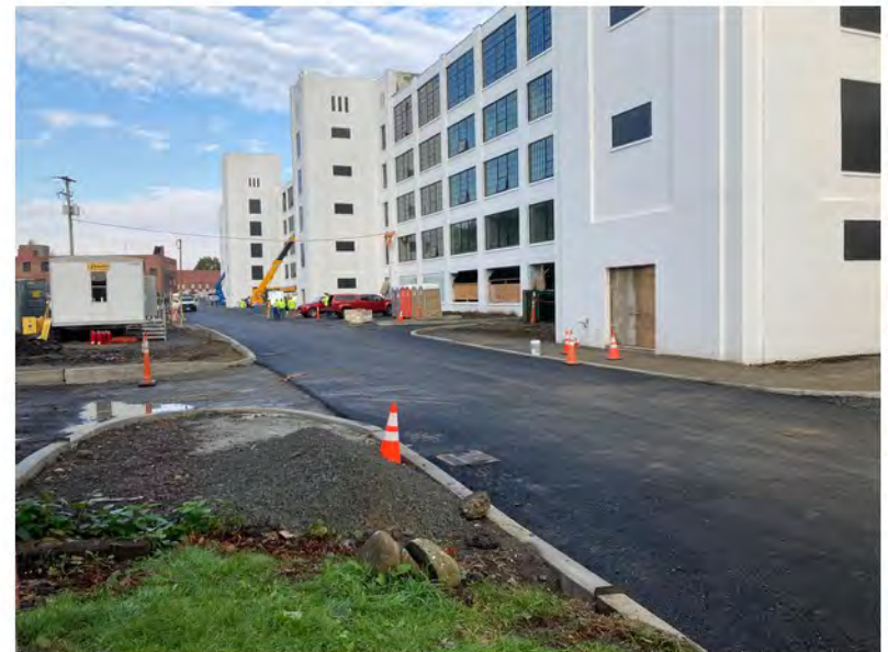
2022-10-07 09:04 42.1154222 N , 75.9508972 W Eastern portion of Helen Drive, looking west