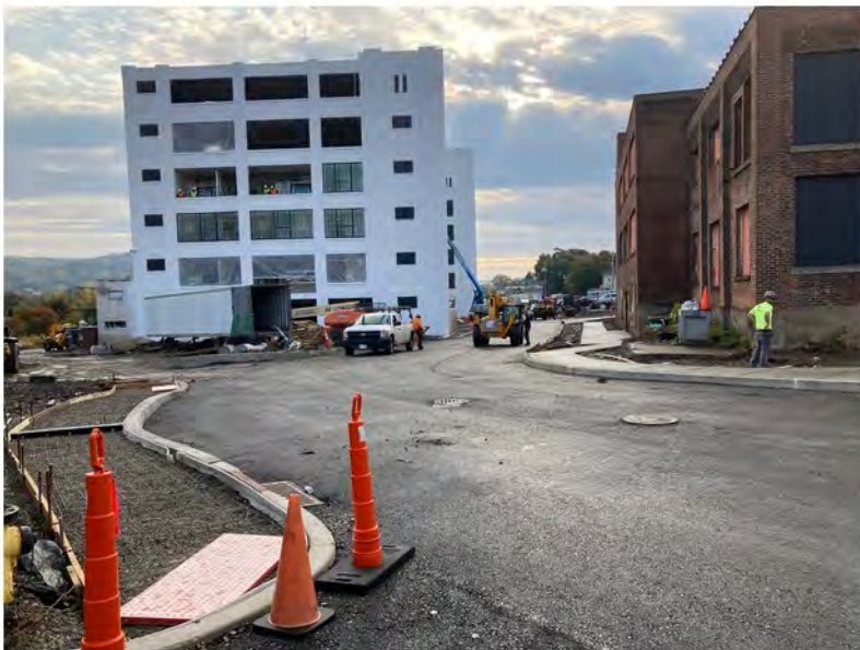
2022-10-07 08:38 42.1159056 N , 75.9536361 W Status of site work, western end of site, looking east