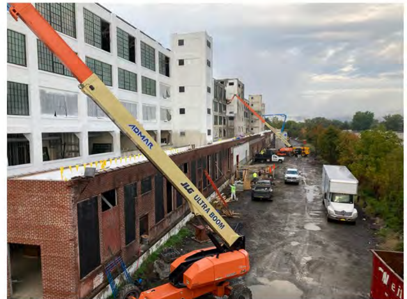
2022-10-07 08:25 42.1155889 N , 75.9503250 W Status of site work, Avenue C looking west