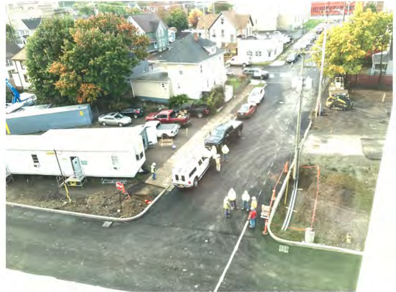
2022-10-07 08:48 42.1155583 N , 75.9517056 W Aerial view of Helen Drive (foreground) and Avenue A (background), looking south