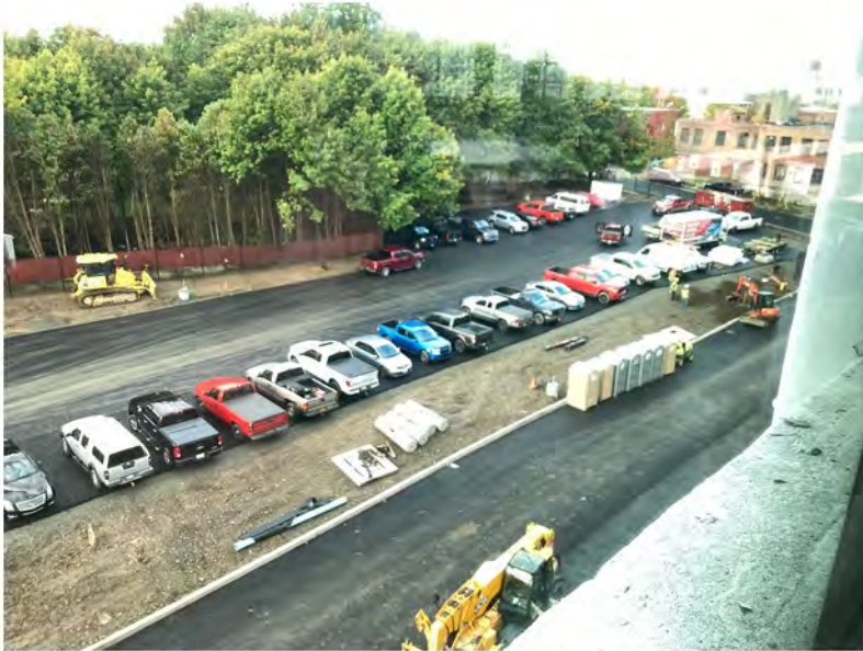
2022-10-07 08:48 42.1156167 N , 75.9518056 W Aerial view of Helen Drive and southwestern parking lot, looking southwest