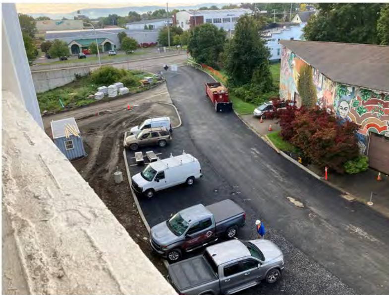
2022-10-07 08:58 42.1152611 N , 75.9509361 W Aerial view of eastern portion of Helen Drive, looking southeast