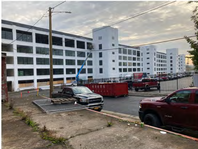
2022-10-07 08:19 42.1153972 N , 75.9531333 W Status of site work, Avenue B looking northeast