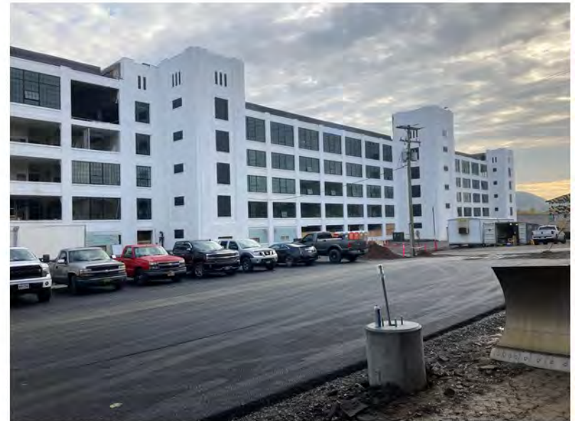
2022-10-07 08:21 42.1156722 N , 75.9520639 W Status of site work, southwestern parking lot looking northeast