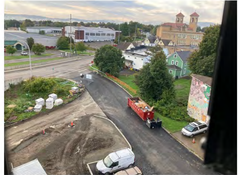
2022-10-07 08:52 42.1152222 N , 75.9506528 W Aerial view of eastern portion of Helen Drive, looking southeast