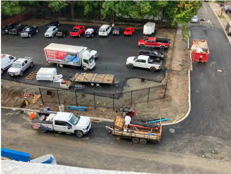
2022-10-07 08:44 42.1156583 N , 75.9528111 W Aerial view of western portion of southwestern parking lot and Avenue B, looking south