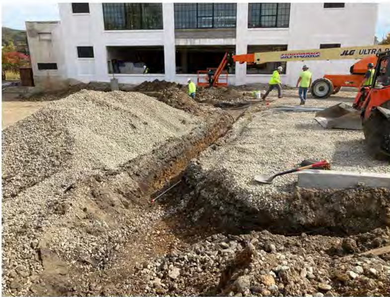
2022-10-12 12:54 42.1159750 N , 75.9531694 W Installation of electrical conduit at the western end of the site (Work Zone #1), looking east.