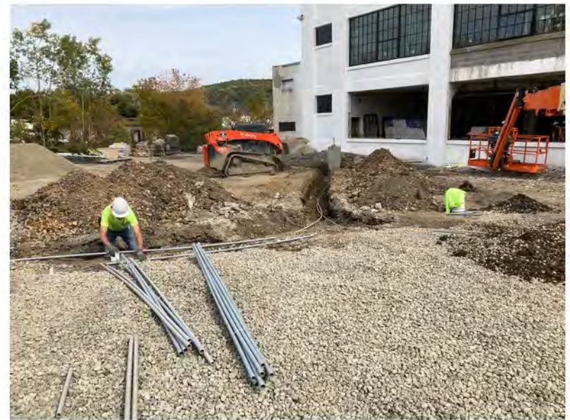
2022-10-12 13:22 42.1154139 N , 75.9525306 W Installation of electrical conduit at the western end of the site (Work Zone #1), looking north.