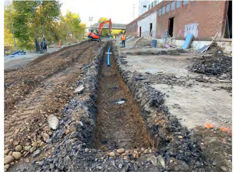
2022-10-11 16:11 42.1161639 N , 75.9515611 W Installation of water line along Avenue C (Work Zone #2), looking east.