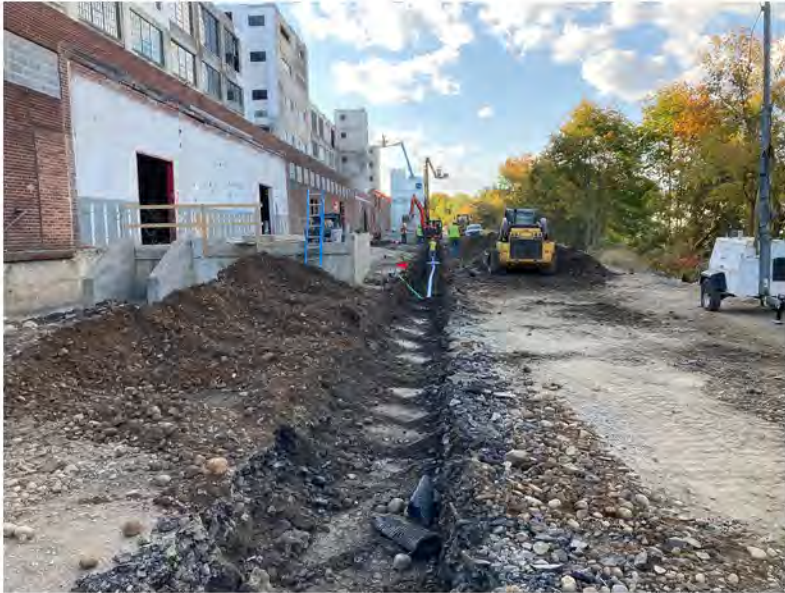
2022-10-11 15:59 42.1156417 N , 75.9508056 W Installation of water line along Avenue C (Work Zone #2), looking west.