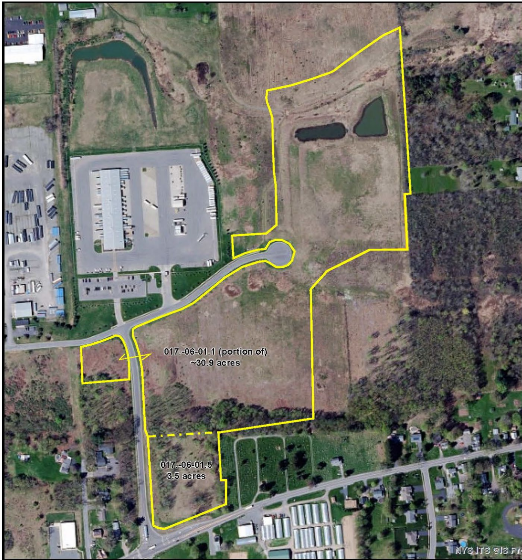
EXHIBIT A SITE MAP