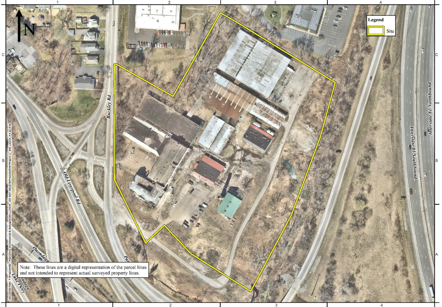
Figure modified for use by the NYSDEC, May 2022