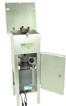
Ambient Air Monitoring