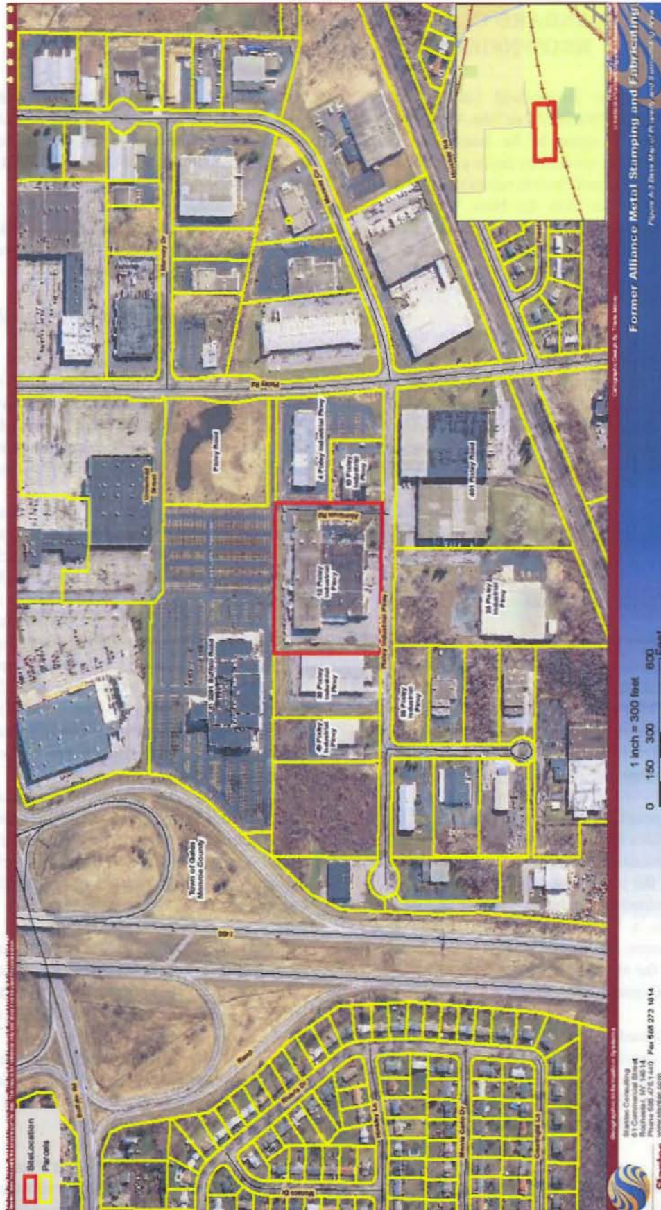
EXHIBIT A SITE MAP

Stantec Consulting 811 Commerce Blvd St. Louis, MO 63102 Phone 636.475.1400 Fax 636.273.1614 stantec.com Copyright 2011