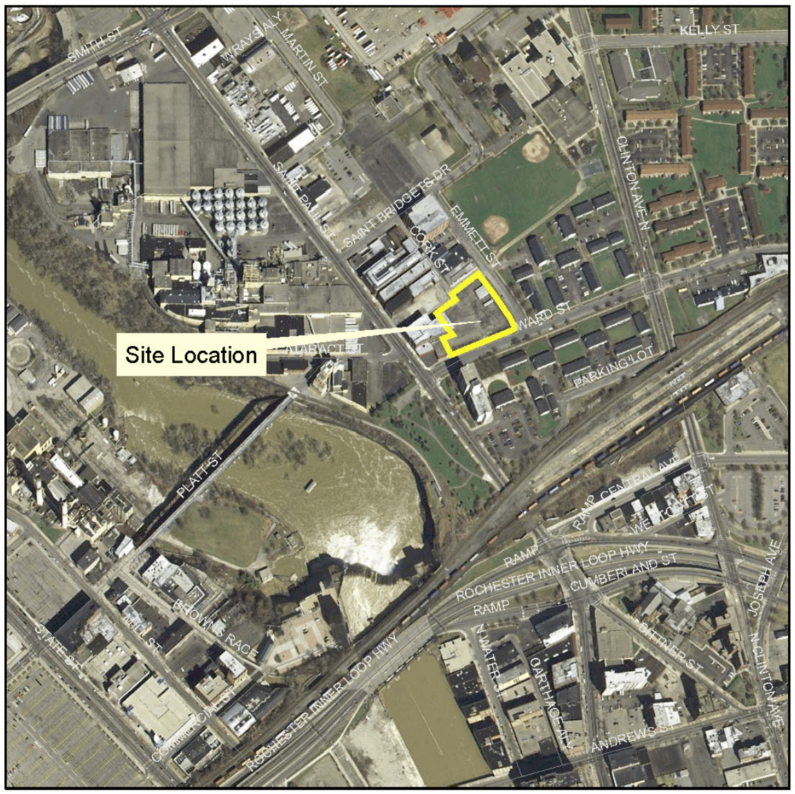
Statewide Digital Orthoimagery Program - Monroe County 2005