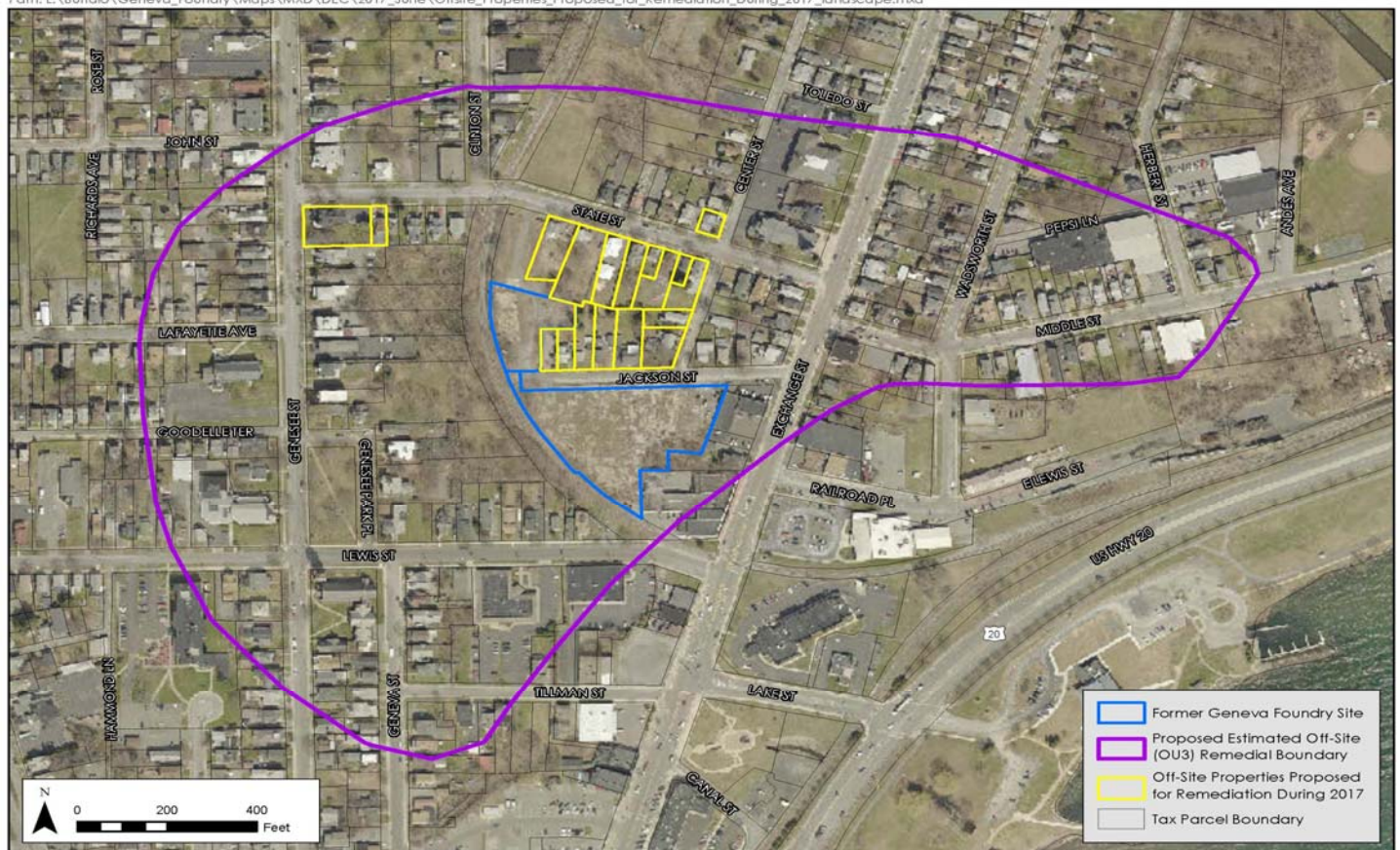
FIGURE 2 - 2017 Remedial Properties and Estimated Offsite Neighborhood Remedial Boundary Site No. C835027A Geneva, Ontario County, New York

Path: L:\Buffalo\Geneva_Foundry\Maps\MXD\DEC\2017_June\Offsite_Properties_Proposed_for_Remediation_During_2017_landscape.mxd