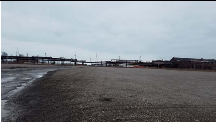
View of access road and cover from southeast corner