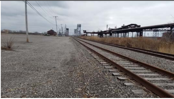
Railroad tracks on west portion of Site