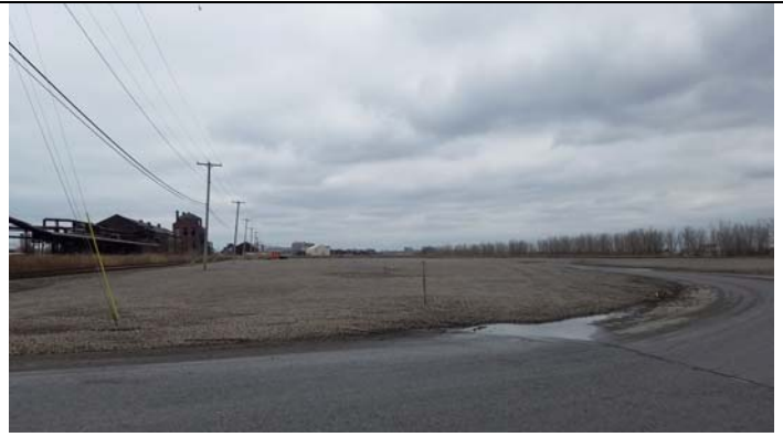
West portion of Site from southwest corner facing north