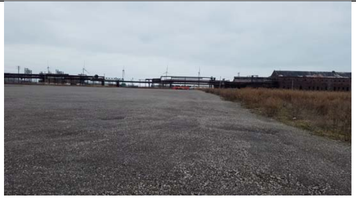
North Site boundary from northeast corner