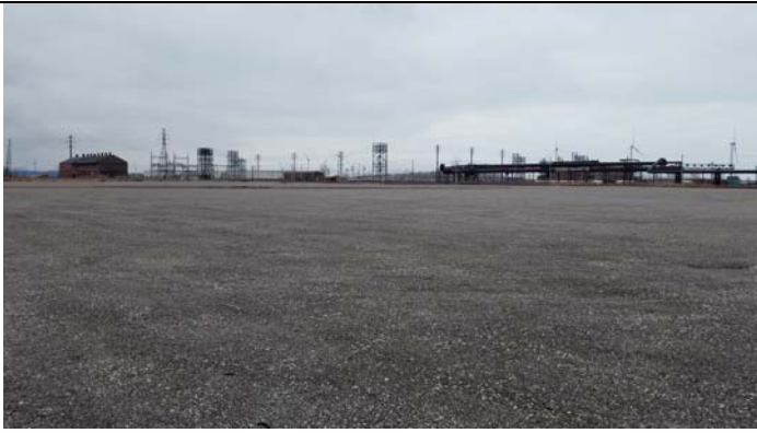
Site from northeast corner facing southwest