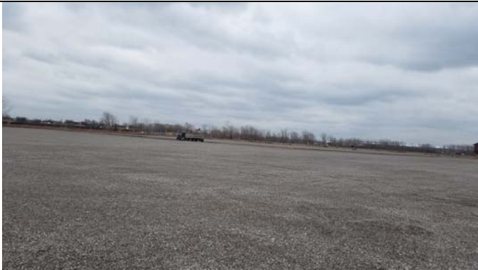
Site from northwest corner facing southeast