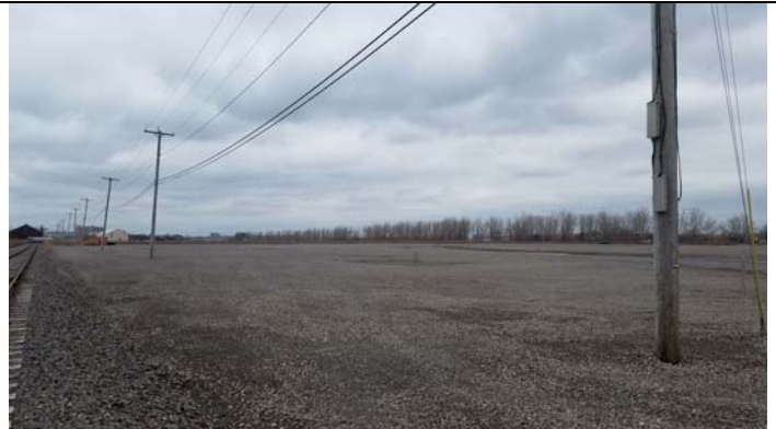
Site from southwest corner facing northeast