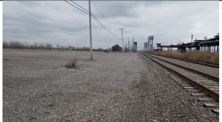
West portion of Site from northwest corner facing south