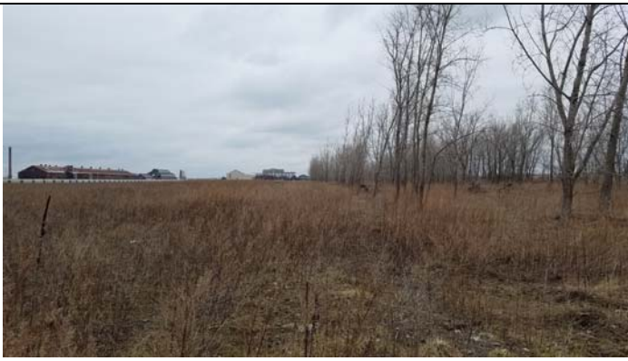
East Site boundary from southeast corner