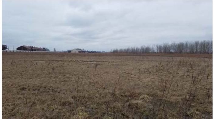
Site from south boundary facing north