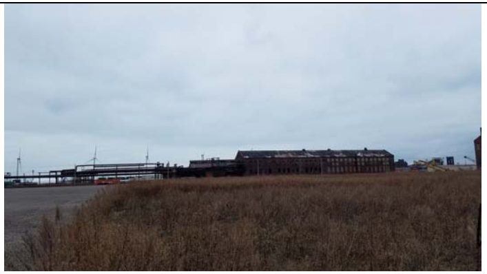
South Site boundary facing west from southeast corner