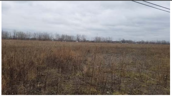
Site from northwest corner facing southeast