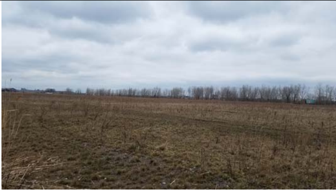
Site from the southwest corner facing northeast