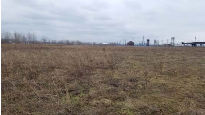
Site from north boundary facing south