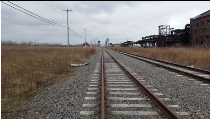
Railroad tracks on west portion of Site