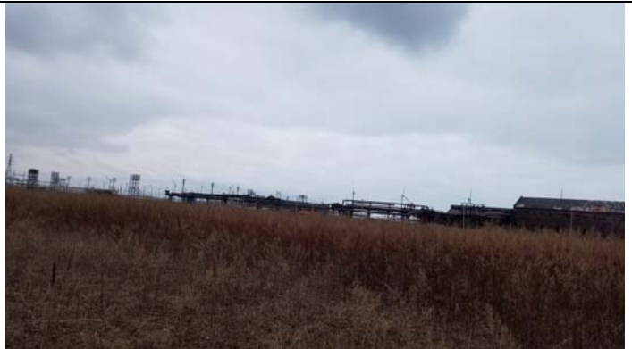
Site from northeast corner facing southwest