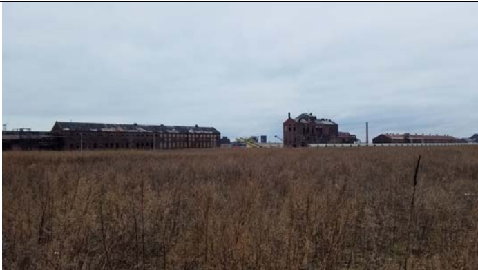
Site from southeast corner facing northwest