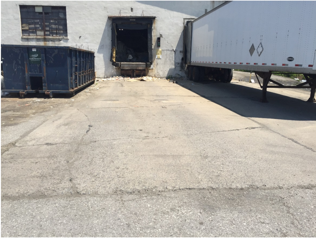
Photo 5 – Building Apron Concrete System (south end of building) looking east.