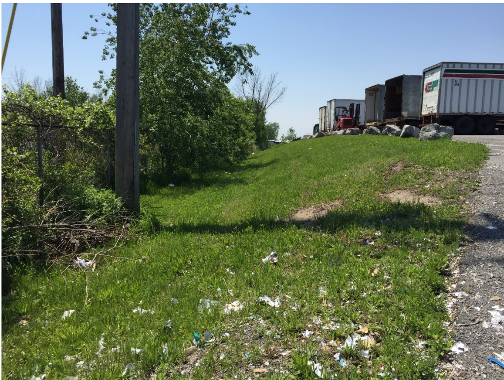
Photo 10 – GCL and Soil Cover System looking west along south slope.