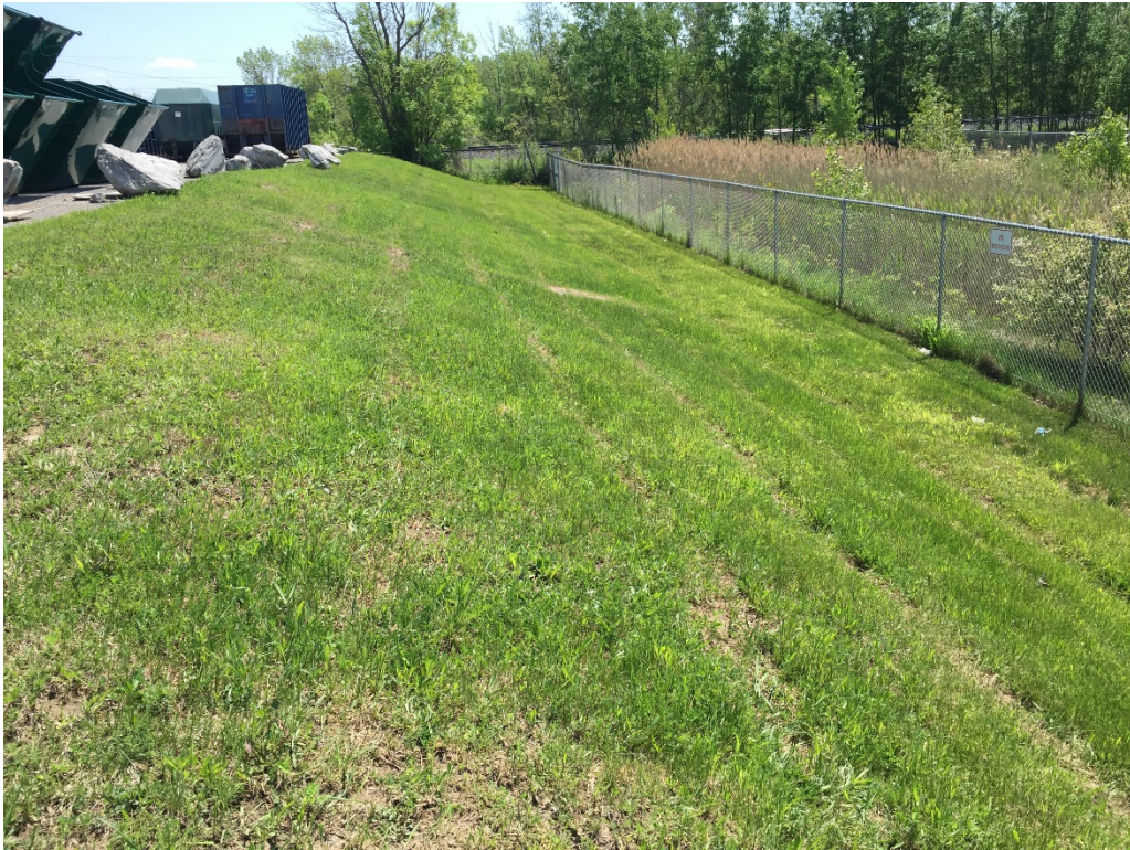
Photo 9 – GCL and Soil Cover System looking south along west slope.