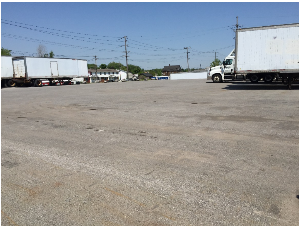
Photo 12 – GCL and Asphalt Cover System looking northeast across cap.