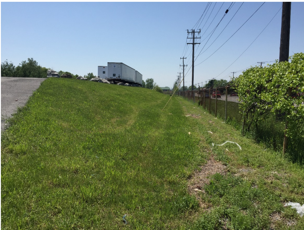
Photo 8 – GCL and Soil Cover System looking west along north slope.