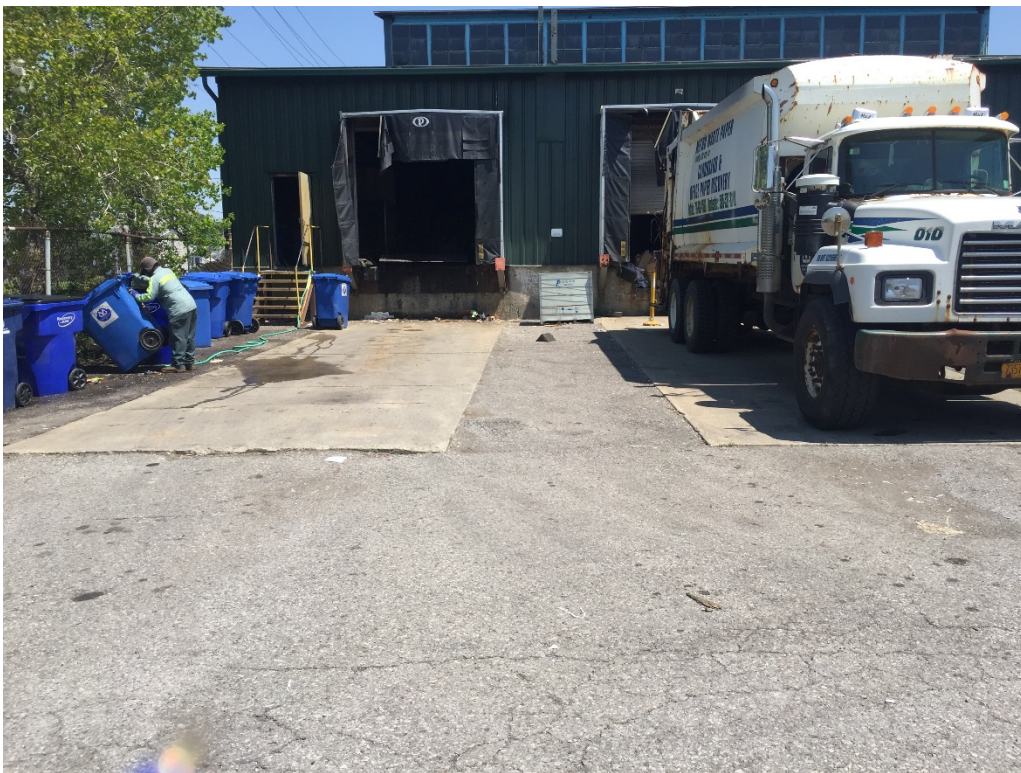
Photo 4 – Building Apron Concrete System (north end of building) looking east.