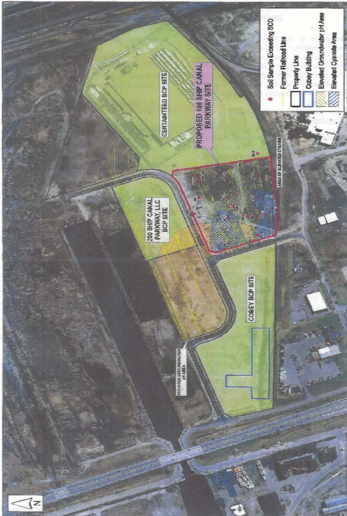
EXHIBIT A SITE MAP