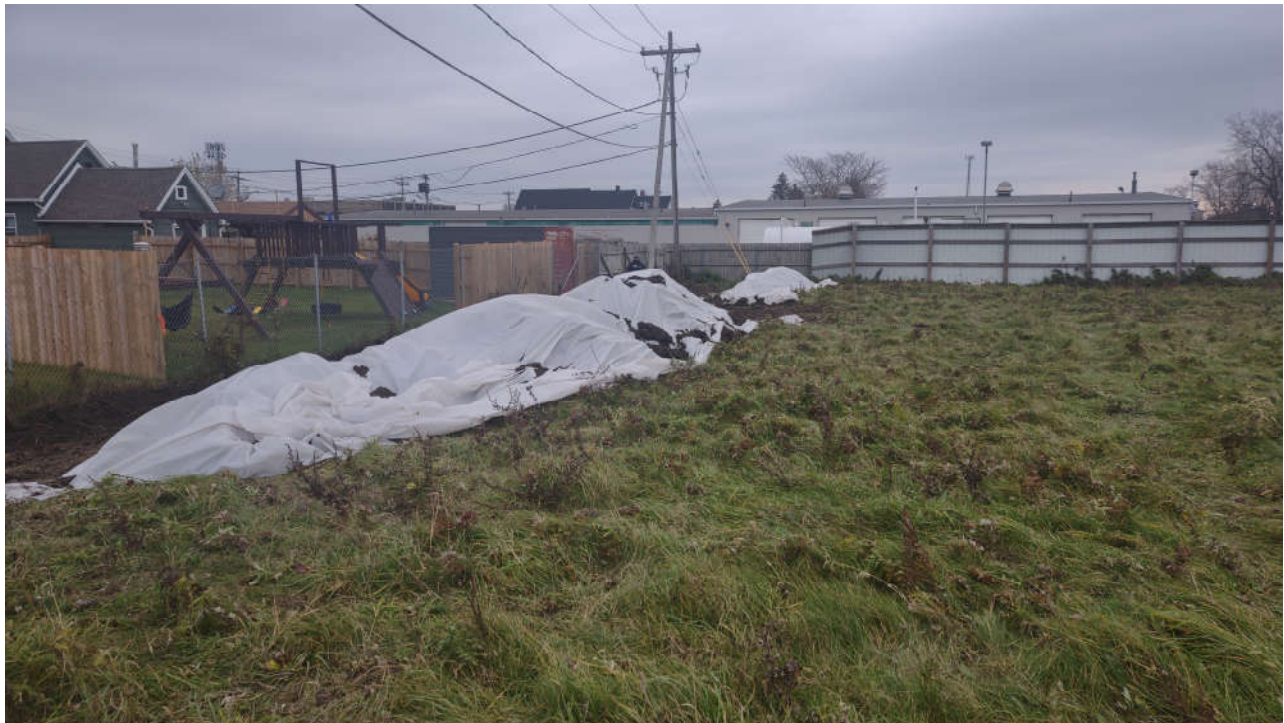
Photo #8: Temporary staging of excavated materials from Dingens property line excavation