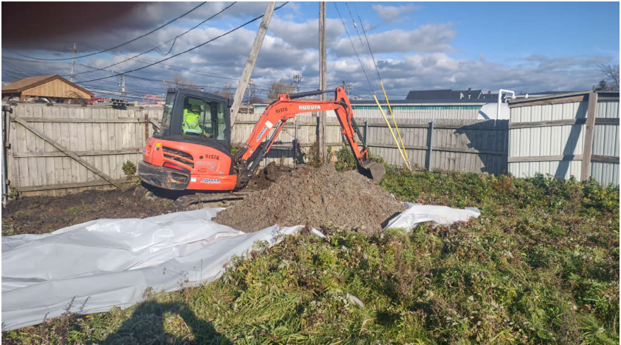
Photo #3: Excavation in progress at Dingens property line / staging of excavated materials