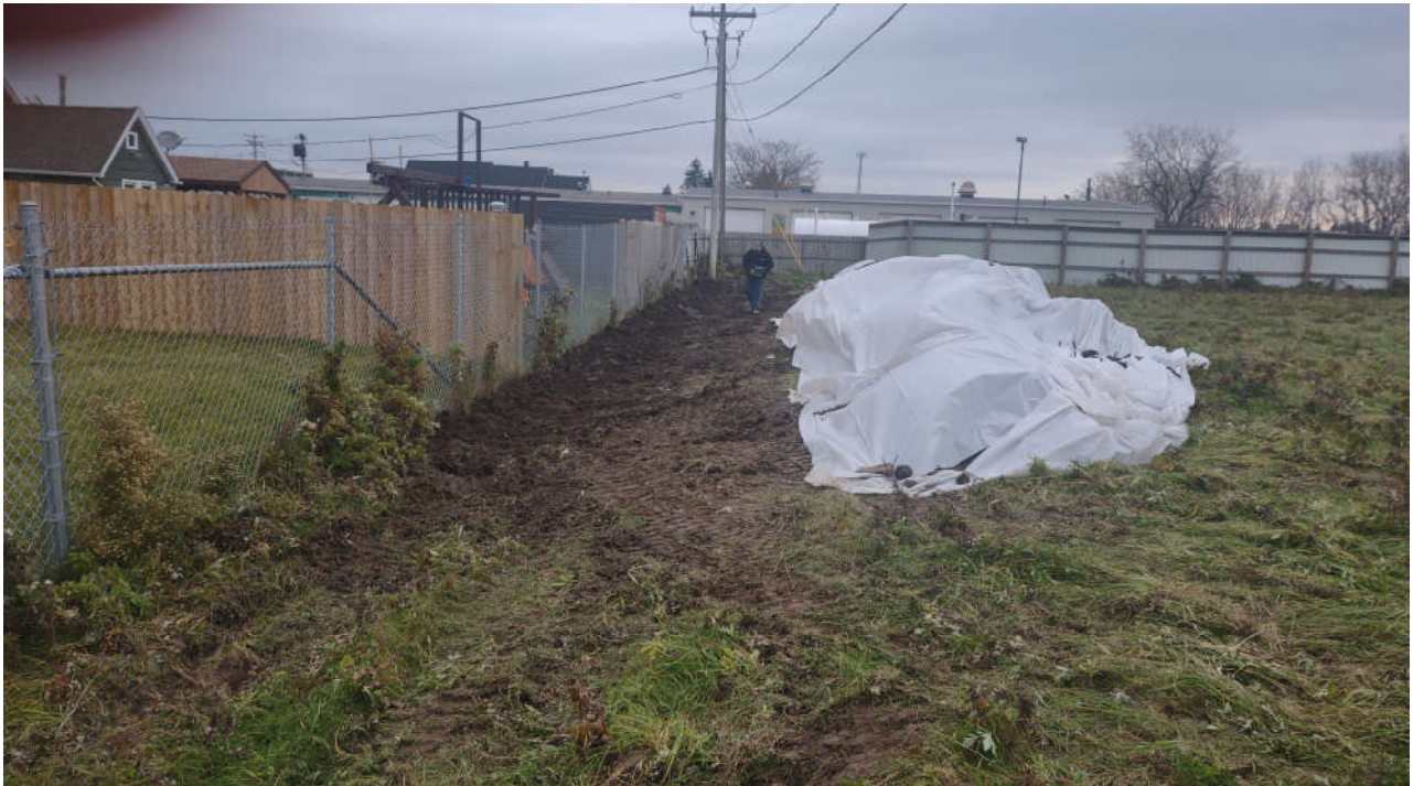
Photo #7: Completion / re-seeding of Dingens property line excavation