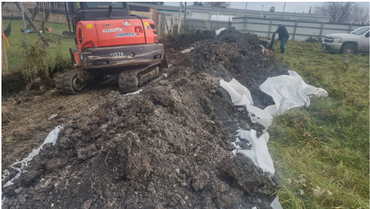
Photo #4: Excavation in progress at Dingens property line / staging of excavated materials