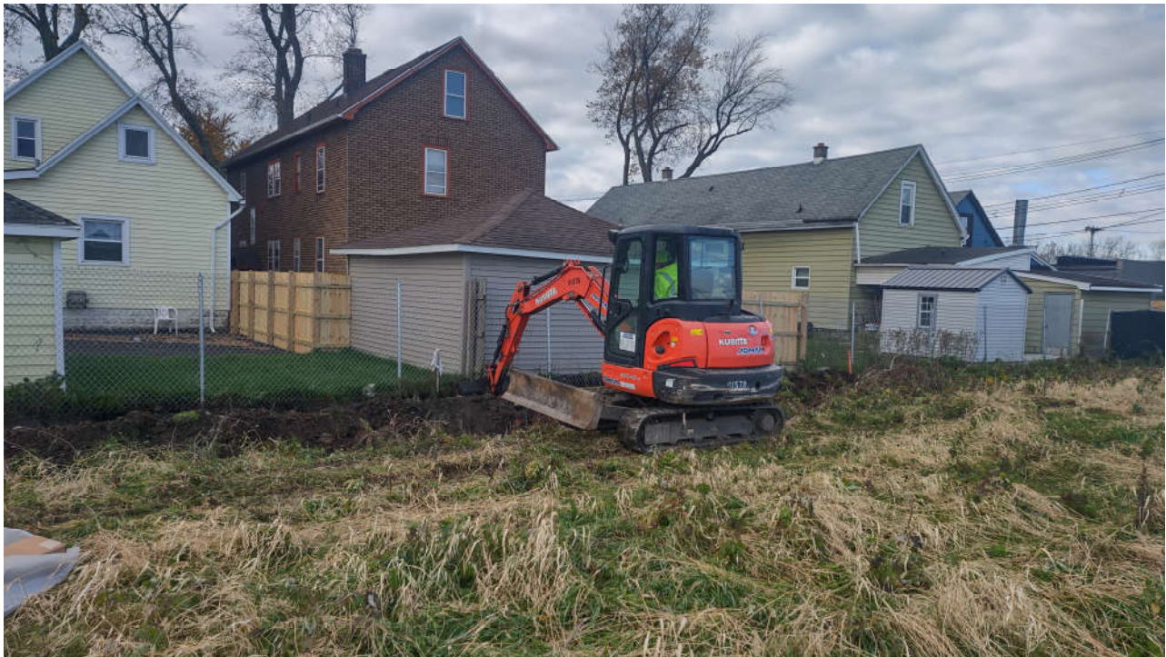
Photo #10: Excavation in progress at Peru property line excavation