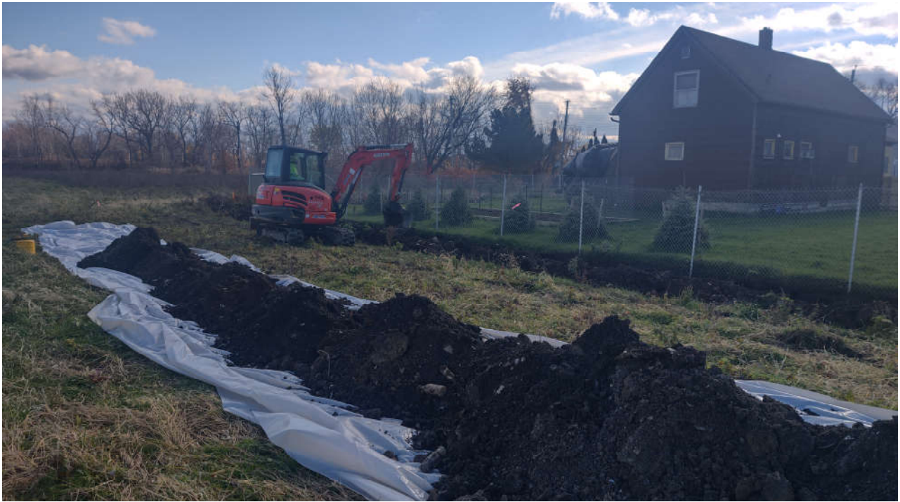
Photo #11: Excavation in progress at Peru property line excavation