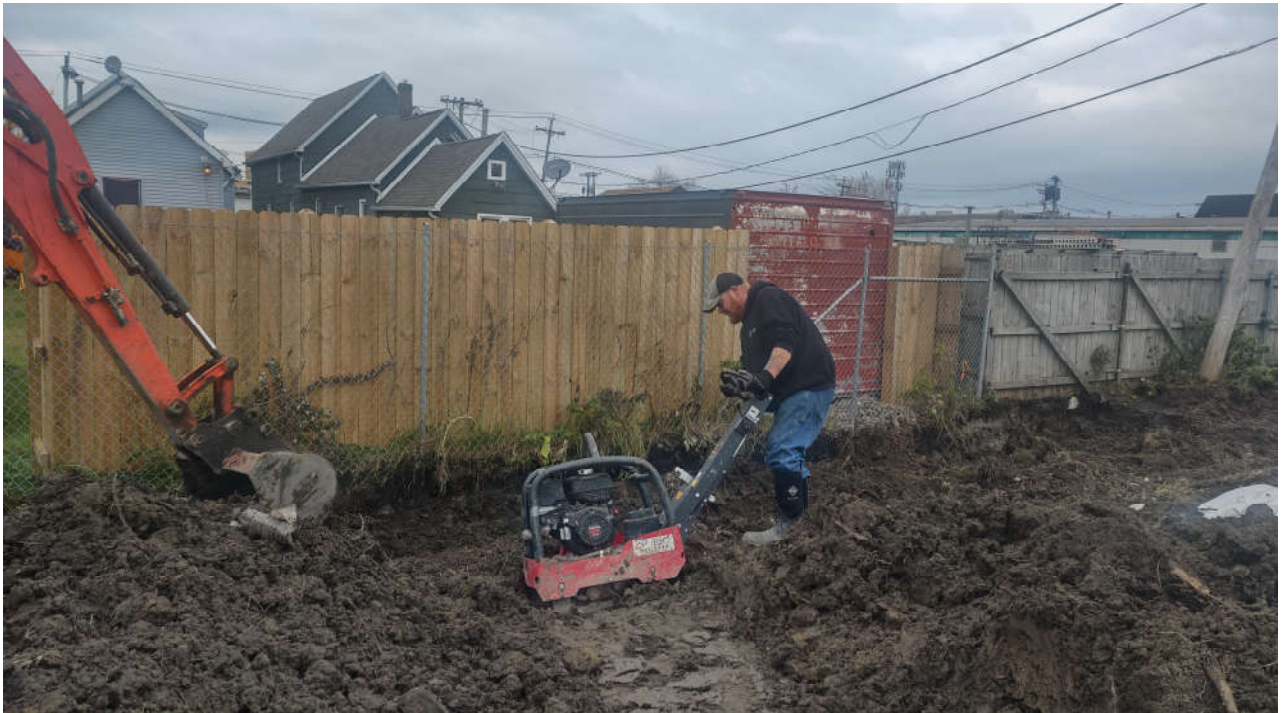
Photo #5: Backfilling and compaction at Dingens property line excavation