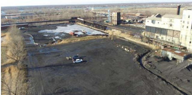
Coal and coke inventories left on-site are being removed for reuse elsewhere.