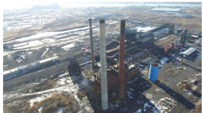
Coke ovens, by-products, storage tanks, stacks and other above-grade infrastructure remain on site today, but will be demolished during the Brownfield Cleanup Program.

The Riverview Innovation & Technology Campus (RITC) site encompasses about 86 acres of the 102-acre former Tonawanda Coke Corporation (TCC) facility at 3875 River Road, Town of Tonawanda. The site was used for more than a century as a coke manufacturing and byproducts recovery facility – most recently by TCC between the late 1970s and 2018.