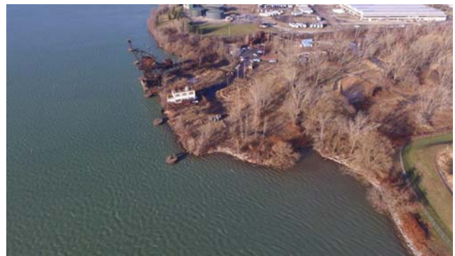
OU3, also referred to as Site 108, (shown above) is an operable unit nearest the Niagara River where an abandoned tank farm was located.

Outside of the boundaries of the main facility comprising the BCP footprint are three operable units that will be fully remediated by Honeywell International. In February 2020, DEC executed a consent order with Honeywell International, the corporate successor to a prior facility owner, to investigate and remediate each operable unit in a manner that is fully protective of public health and the environment.