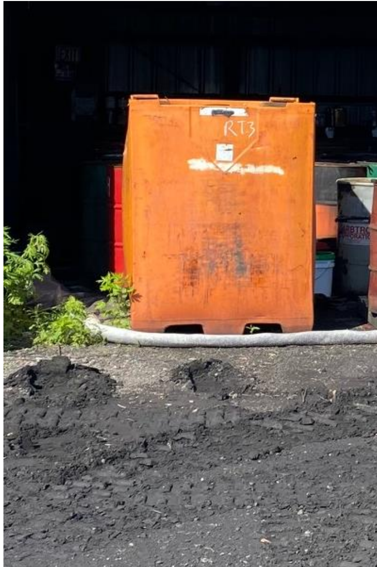
Photograph C-11 300-Gallon Tote RT-3 Appearance of Waste Oil