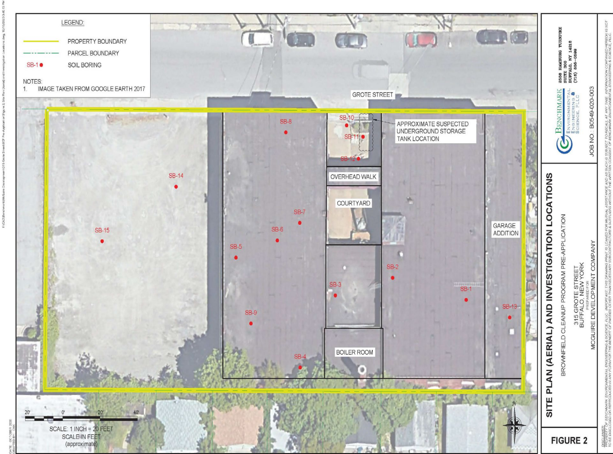
EXHIBIT A SITE MAP