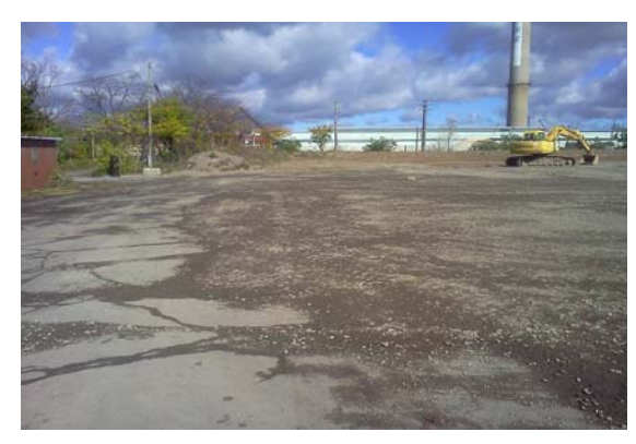
After remediation: west side entrance of site