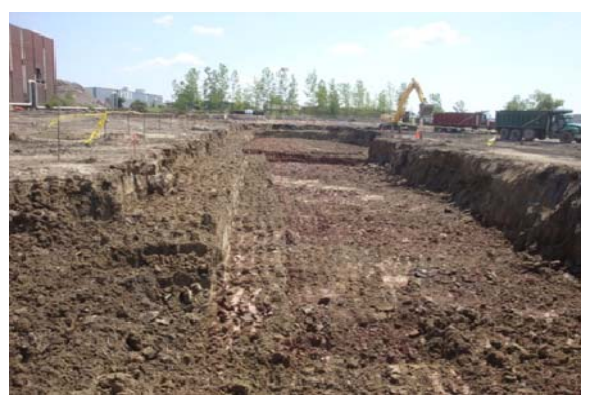
During Remediation: Soil excavation at Former Mill #2 Site