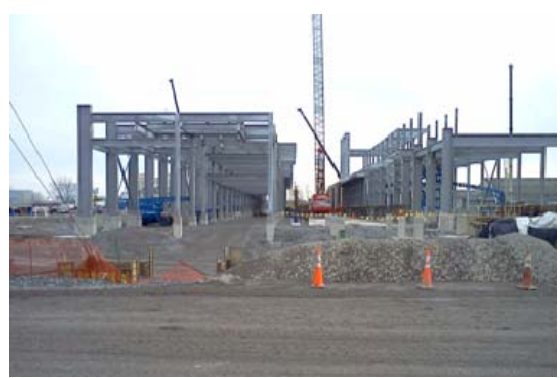
After: Former Mill #2 Site clean with redevelopment already under construction