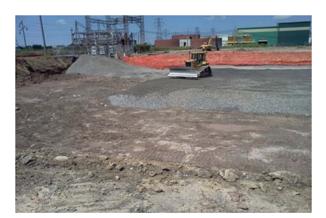
During Remediation: Site backfilling at Former Mill #2 Site