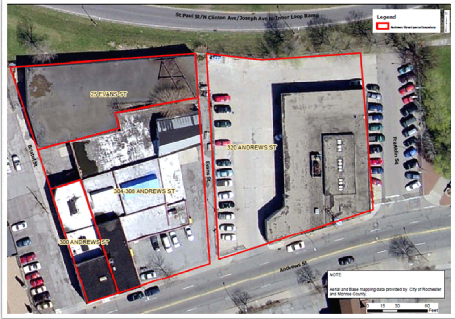
Figure 2- Andrews Street Site 2009 (Pre- demolition)