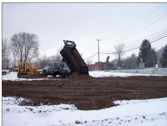
Excavated area backfilled with clean soil.