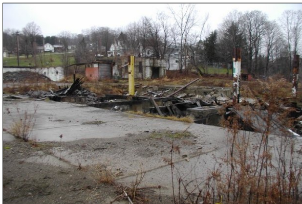
Site prior to remediation.

The ROD is also available on the DEC public website. Go to the Region 9 Environmental Remediation Project Information page at http://www.dec.ny.gov/chemical/37554.html and look for the Bush Industries entry under the Cattaraugus County listings.