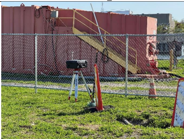
CAMP Station on north side of ExxonMobil site. 042925 - IMG_1885