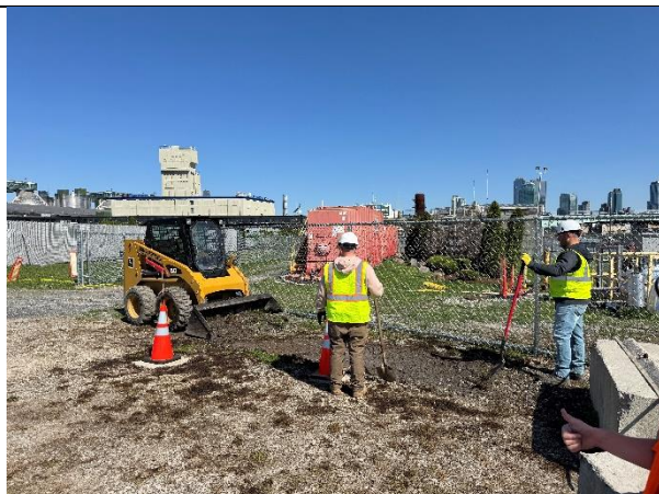
Contractor scraping up top 2" of stained soil. 042925 - IMG_1895