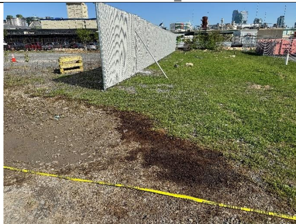
Stained soil on the ExxonMobil site. 042925 - IMG_1884