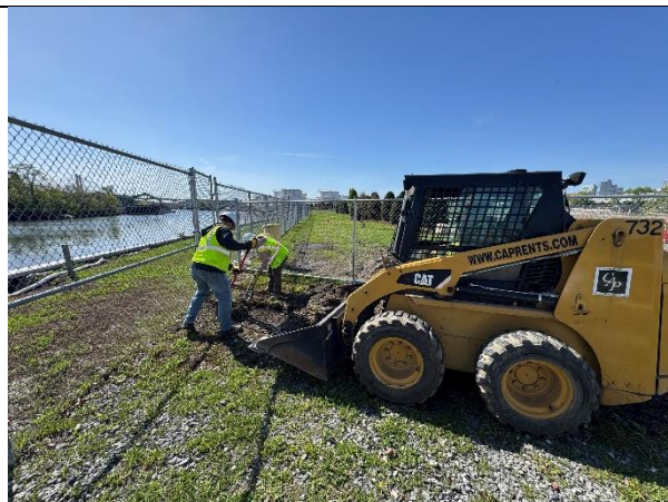
Contractor using shovels to assist in removal of stained soil. 042925 - IMG_1893