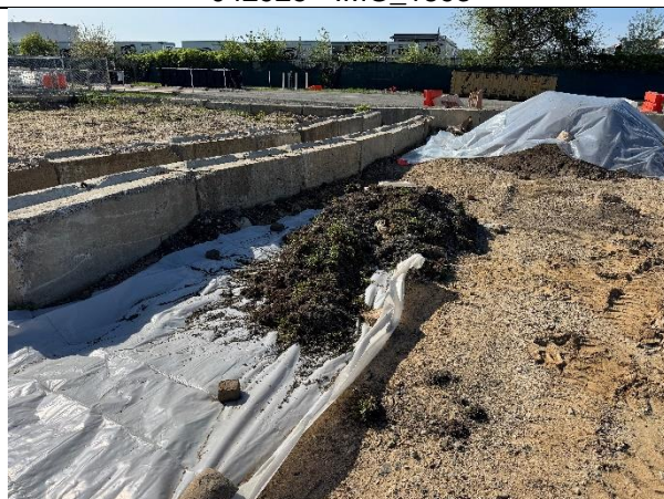
Soil being stockpiled on poly in dedicated impacted soil area. Additional poly was laid down after photo was taken. 042925 - IMG_1887