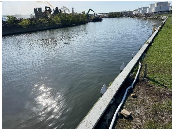
Newtown Creek conditions at the ExxonMobil On-site effluent outfall facing south. 042525 - IMG_1882