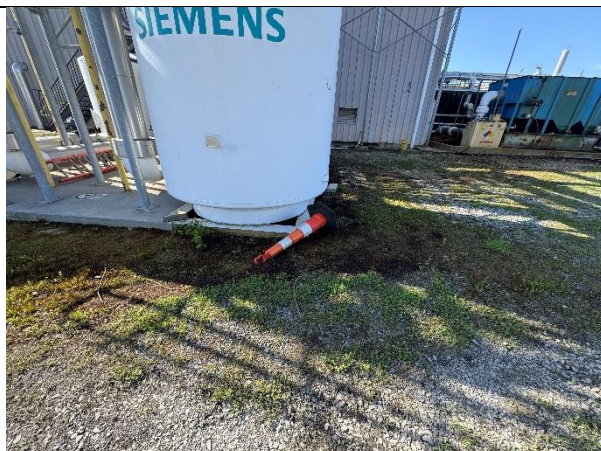
Stained soil to the north of the RCS treatment building on the ExxonMobil site. 042925 - IMG_1876