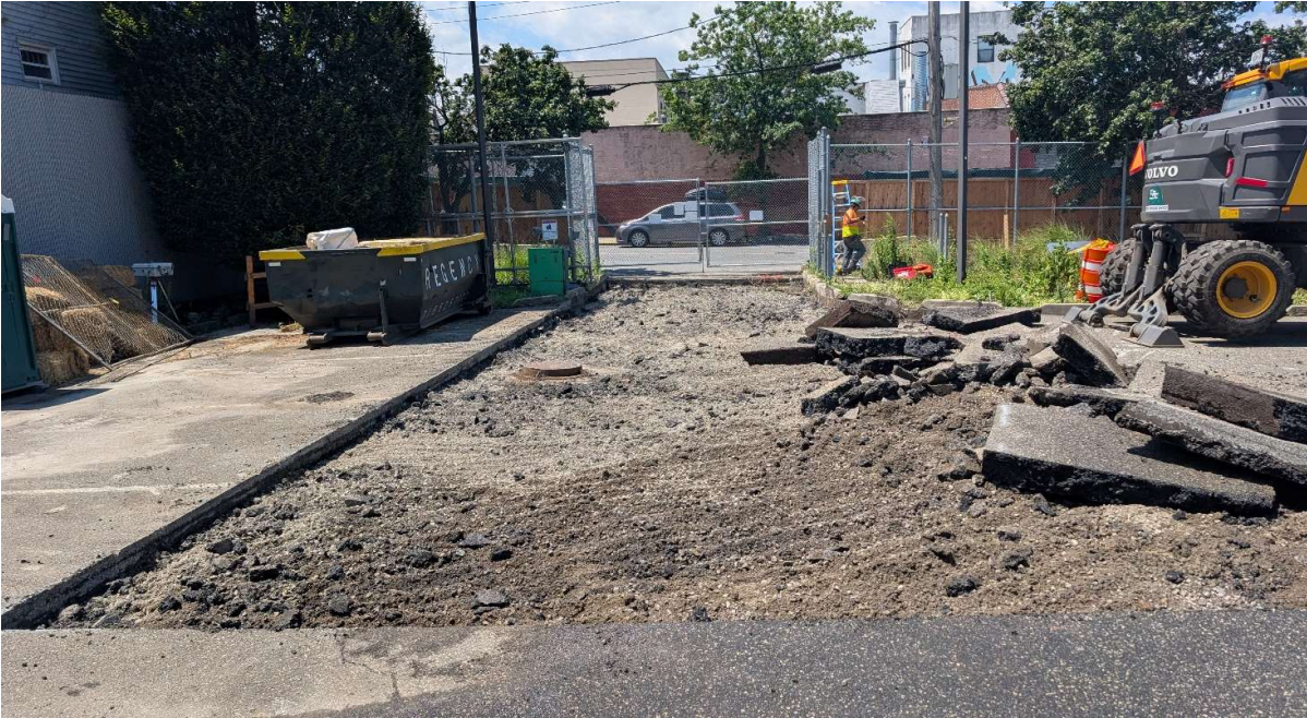
Photo 1: View facing west. View of CAC Stripping asphalt for the stabilized construction entrance.