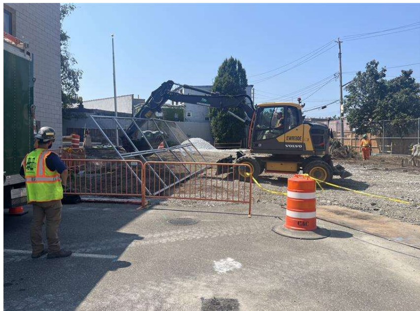
Photo 2: View facing southwest. View of Contractor moving fencing debris.