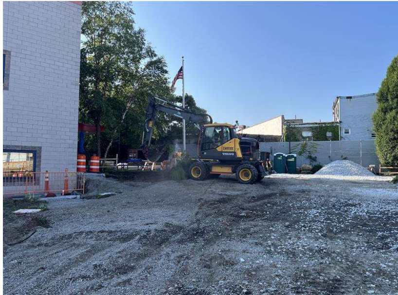
Photo 1: View facing south. Worker spraying water for dust suppression for materials being moved on site.