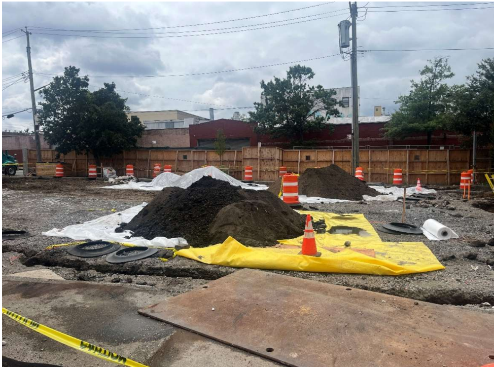
Photo 2: View facing west. View of soil in the process of being stockpiled on poly sheeting.