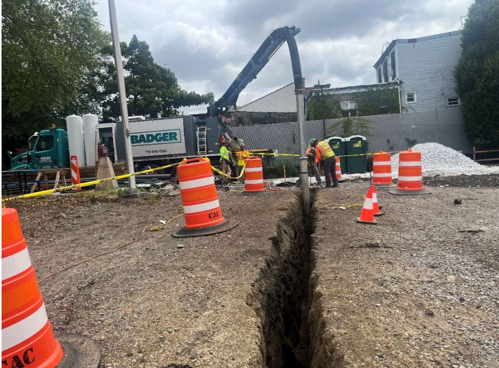
Photo 1: View facing south. CAC using guzzler vacuum truck to soft dig the new building perimeter for utility clearance.