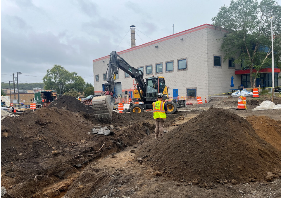
Photo 3: View facing east; View of CAC excavating soil to locate existing gas piping.