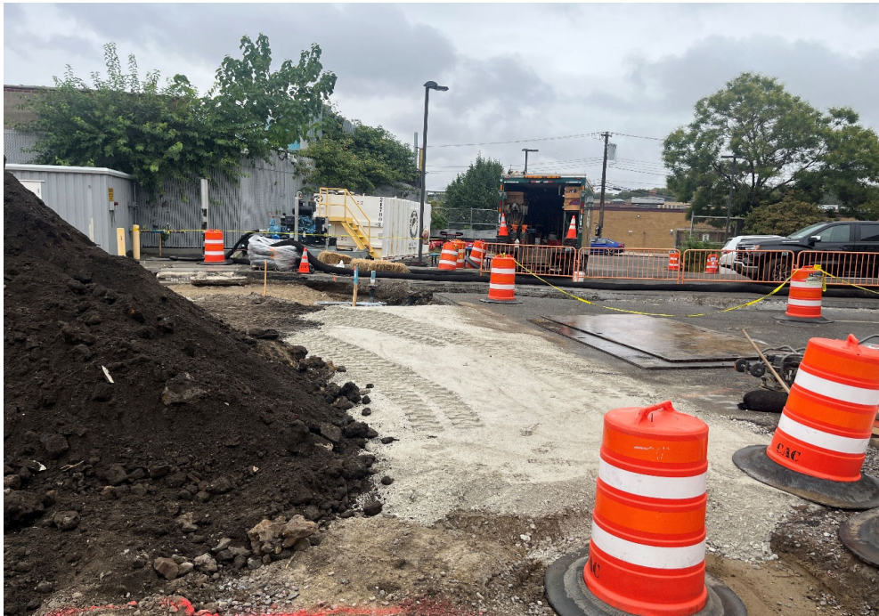
Photo 4: View facing north; View of backfilled area after RW-I modifications.