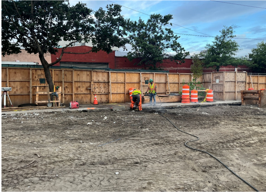
Photo 1: View facing west; View of CAC saw cutting sidewalk to locate existing gas piping.