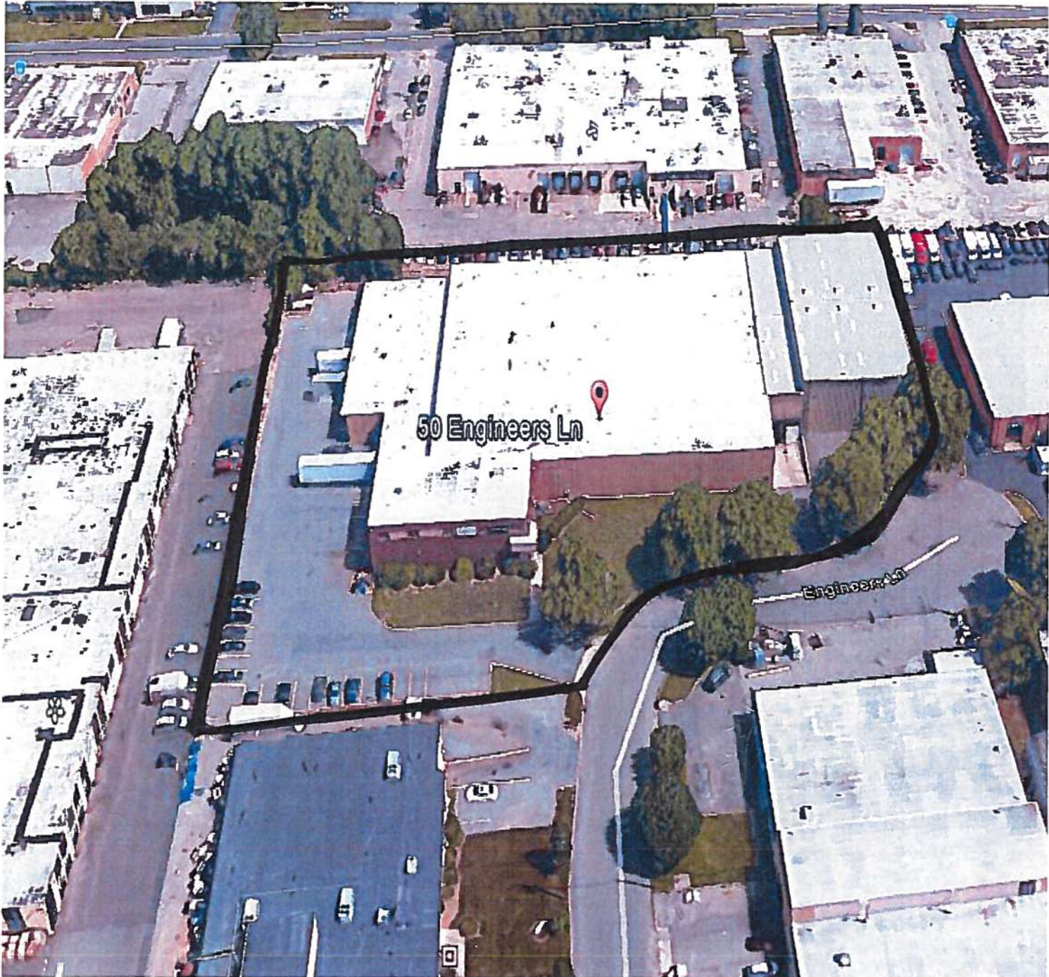
50 Engineers Ln Farmingdale, NY Cleanup Agreement Site No. V00193 Approximate Site Boundaries (Not For Scale)