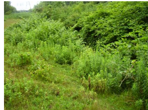
Overgrown stream bank. >

Distribution: M. Doster/ file: report.hw915196.2007-07-02.PitCleanoutInspection.pdf