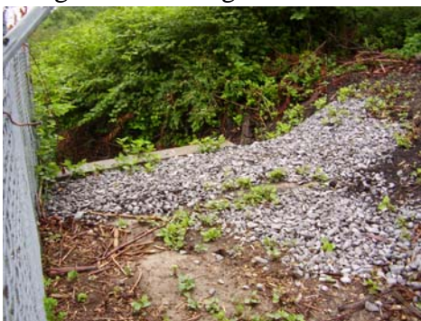
< Repaired drainage pipe inlet.