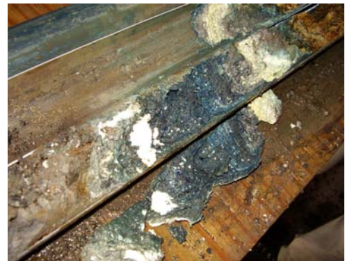
Blue-colored fill. >