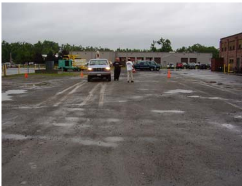
< Area of boring grid.