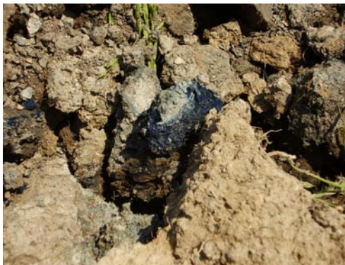
< Waste Material