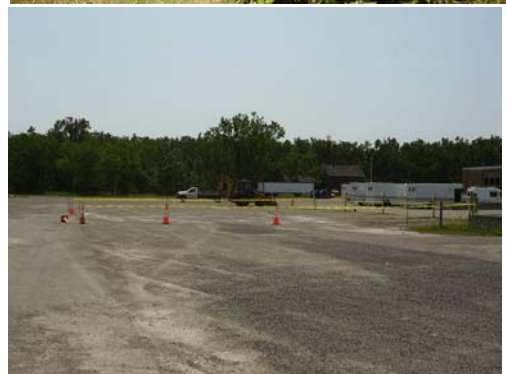
Borings Area. >