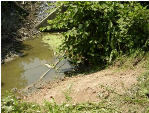
< Excavated Area.