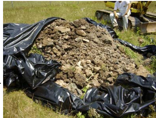
Staged Material. >