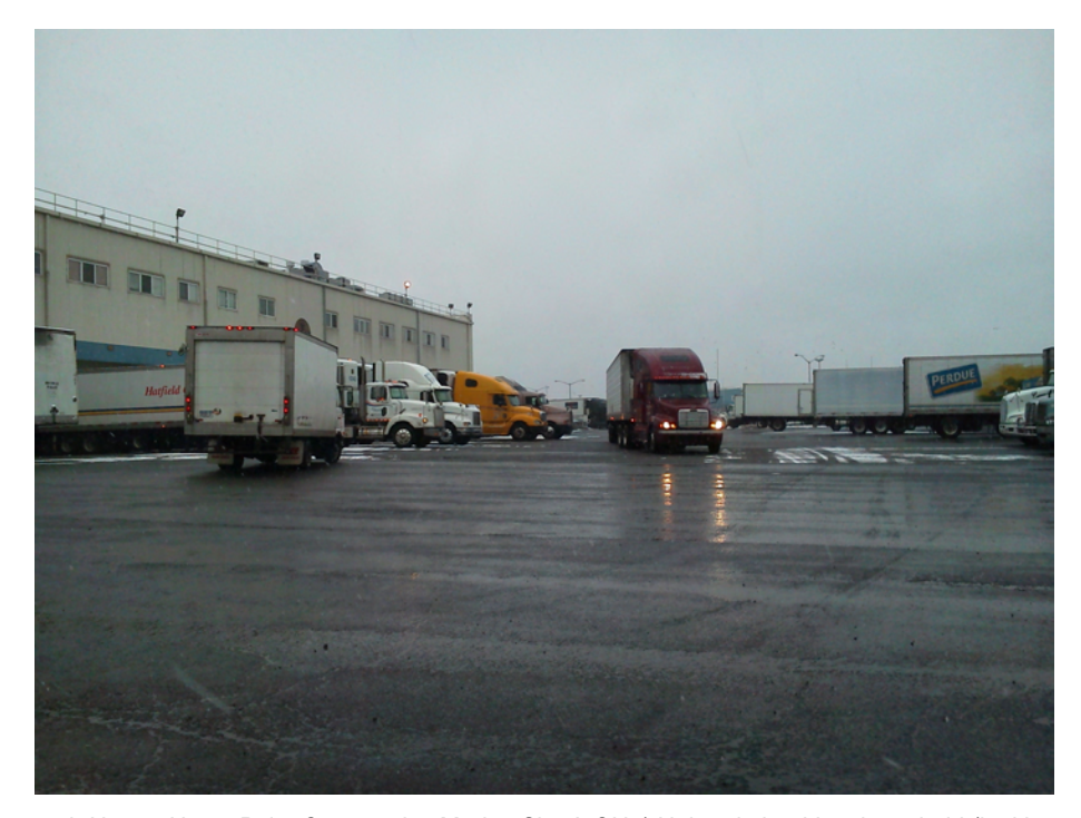
Photograph No. 5 - Hunts Point Cooperative Market Site A OU-1 Nebraskaland Inc. leasehold (looking south)