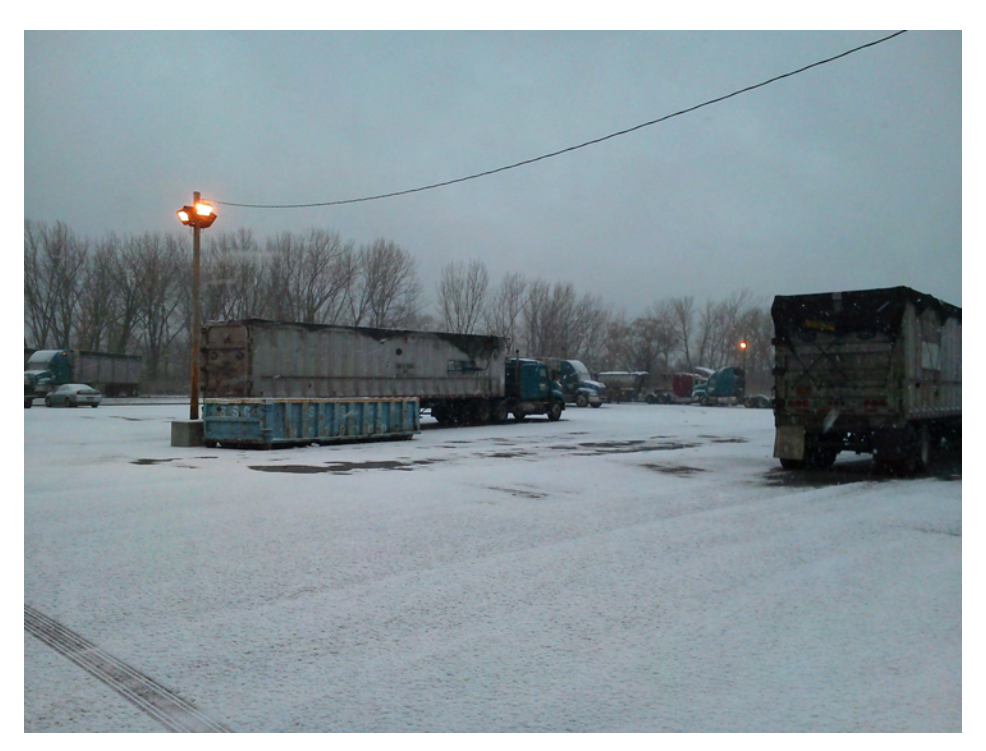
Photograph No. 7 – New Fulton Fish Market employee parking portion of Site A OU-1 (looking southeast)