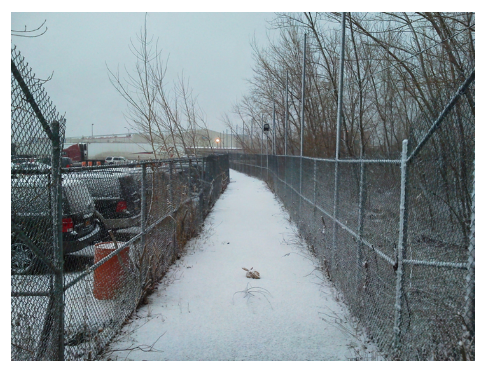
Photograph No. 8 – New Fulton Fish Market employee parking walkway on Site A OU-1 (looking south)