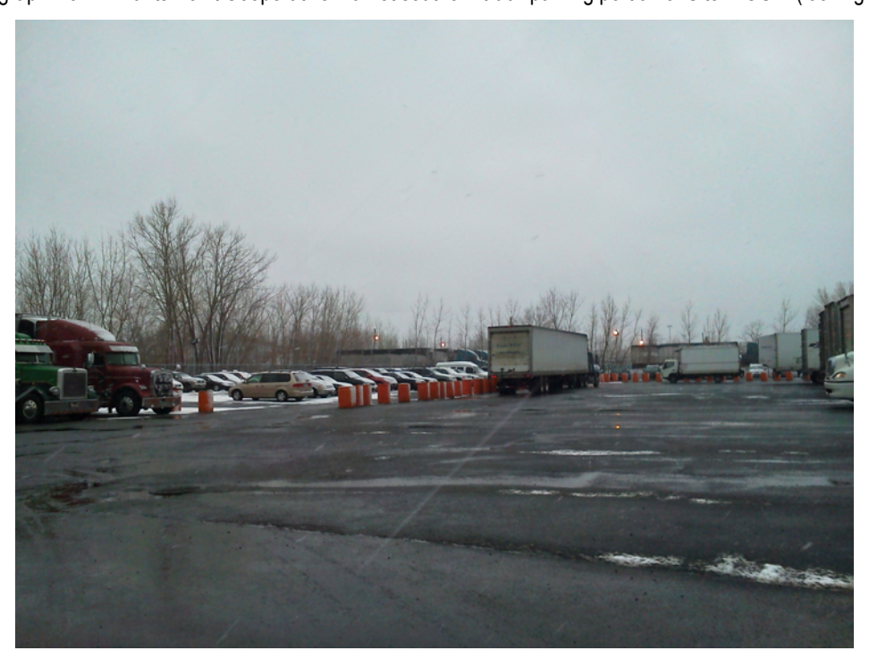
Photograph No. 2 - Hunts Point Cooperative Market employee parking portion of Site A OU-1 (looking north)