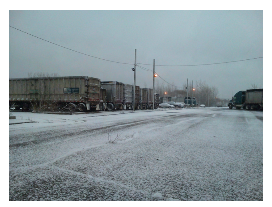
Photograph No. 6 – New Fulton Fish Market employee parking portion of Site A OU-1 (looking northwest)