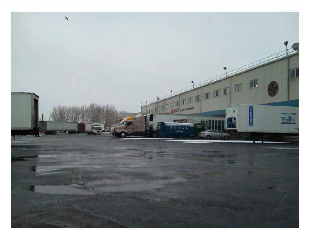
Photograph No. 1 - Hunts Point Cooperative Market southern truck parking portion of Site A OU-1 (looking north)