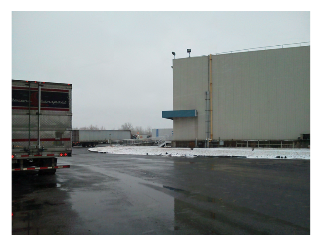
Photograph No. 3 – Hunts Point Cooperative Market vegetated portion of Site A OU-1 (looking North northwest)