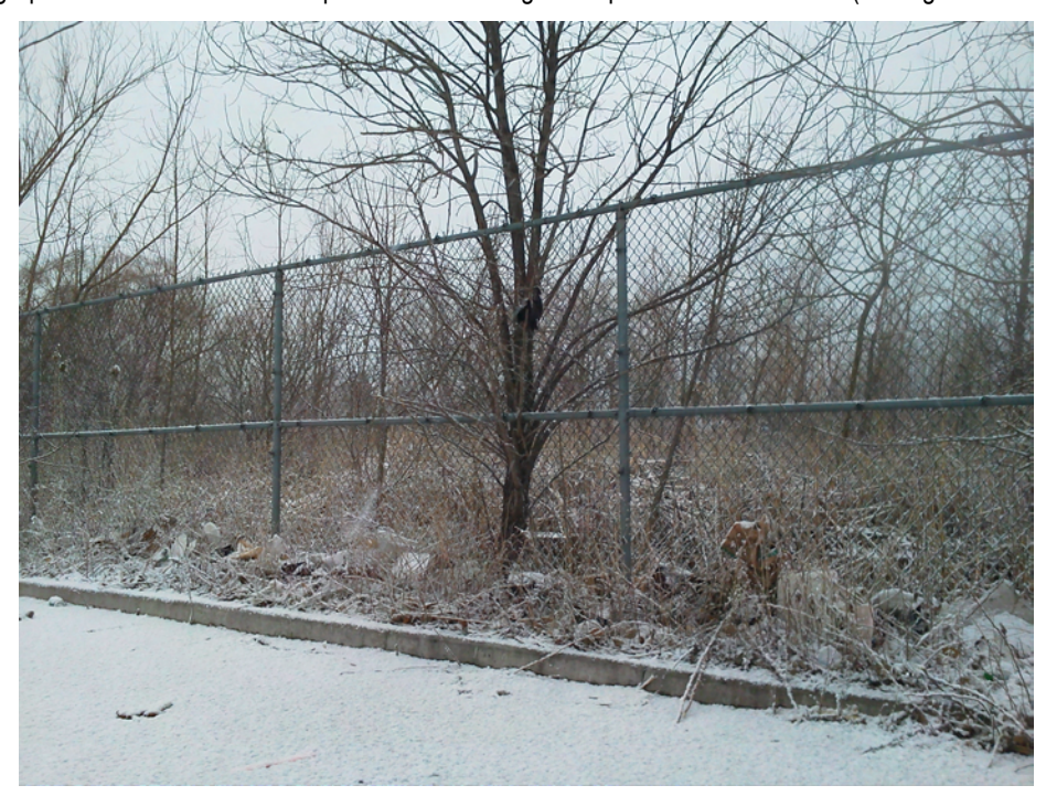
Photograph No.4 - Hunts Point Cooperative Market undeveloped land at northeast end of Site A OU-1 (looking east)