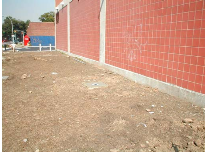
Photo #10 – South side of building following remedial system installation.