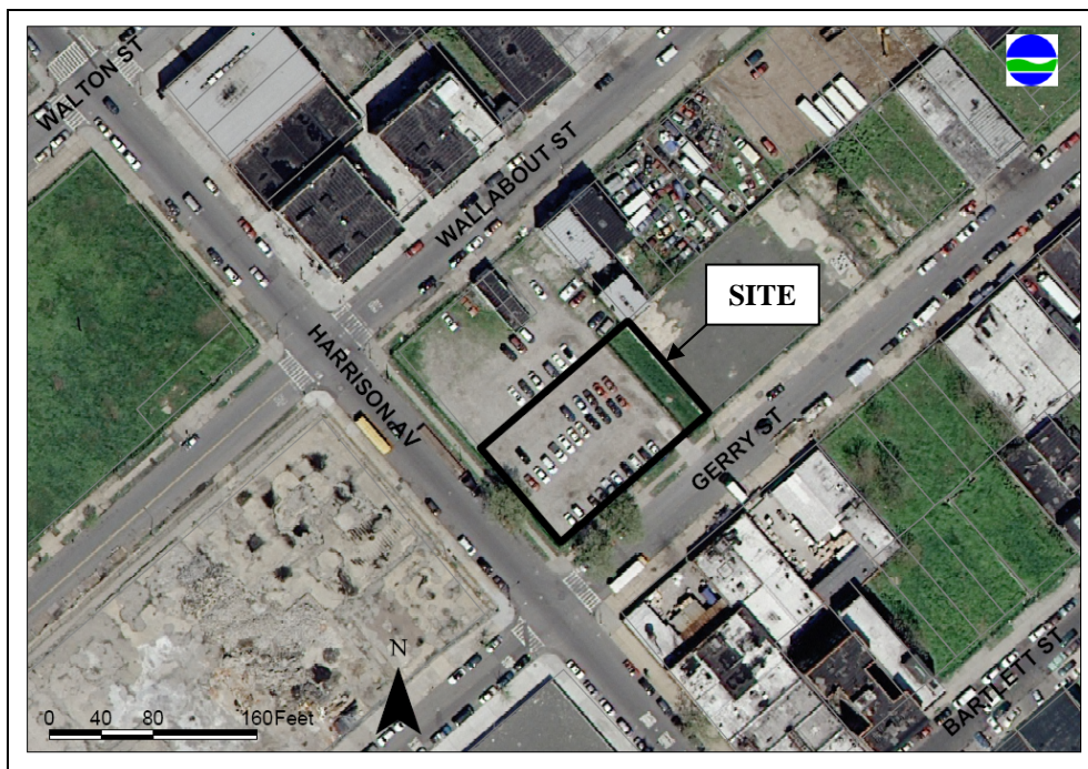
Figure 1 - Site Location Map

Note: Please disregard if you already have signed up and received this fact sheet electronically.