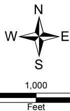
Figure 1 Site Location Map Valley Stream S04 (LIRR) Town of Hempstead, Nassau County Site No. V00404