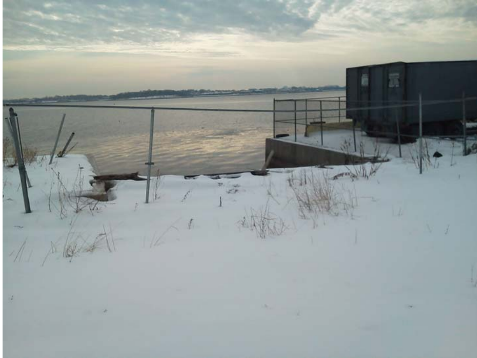
Photograph No. 7 – Portion of Perimeter Site extending into Site C OU-2, Rip-rap upon pipe entering river (looking east-southeast)