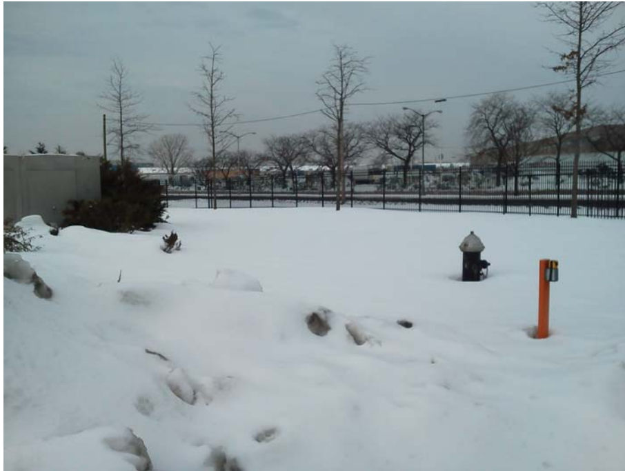
Photograph No. 3 – The southern landscaped area of Site C OU-1 (looking southwest)