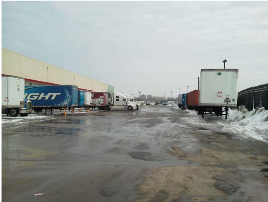
Photograph No. 11 – Rear loading docks and trailer parking of AB Distribution at Site C OU-1 (looking northeast)