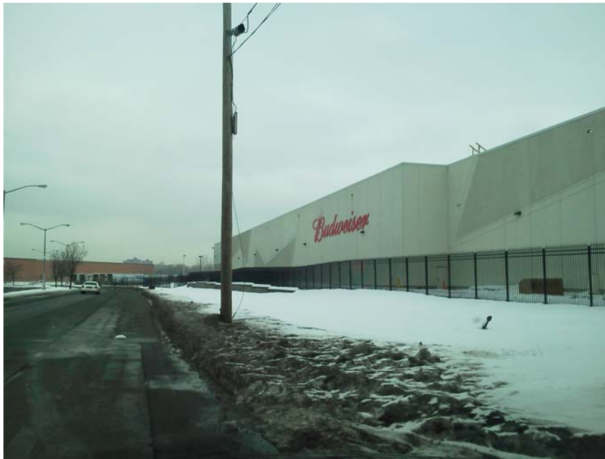
Photograph No. 1 – The southern entrance to Anheuser-Busch Distribution of Site C OU-1 (looking northeast)