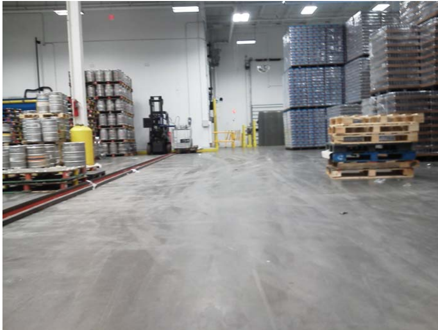
Photograph No. 15 – Interior AB Distribution at Site C OU-1 concrete slab flooring (looking northeast)