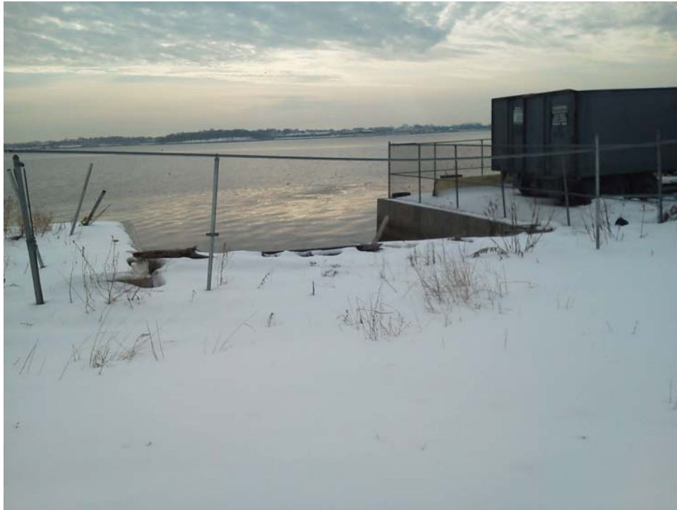
Photograph No. 23 – Portion of Perimeter Site extending into Site C OU-2, Rip-rap upon pipe entering river (looking south)