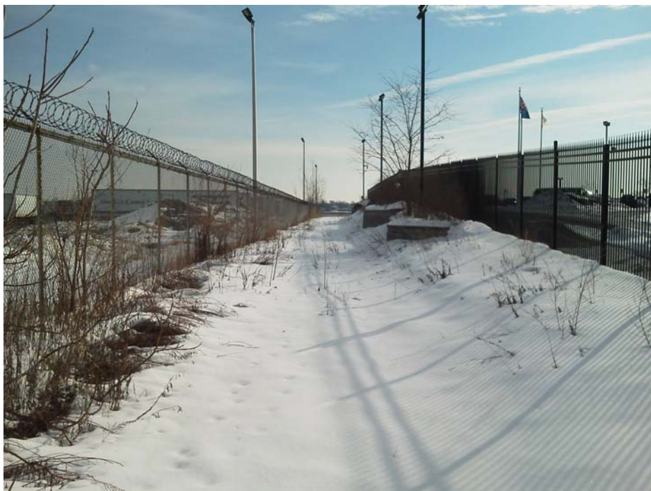
Photograph No. 18 – Site C OU-2 Greenway entrance inside gate (looking east)