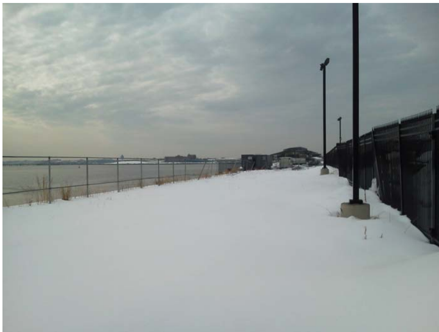
Photograph No. 22 – Site C OU-2 Greenway and river view (looking southwest)