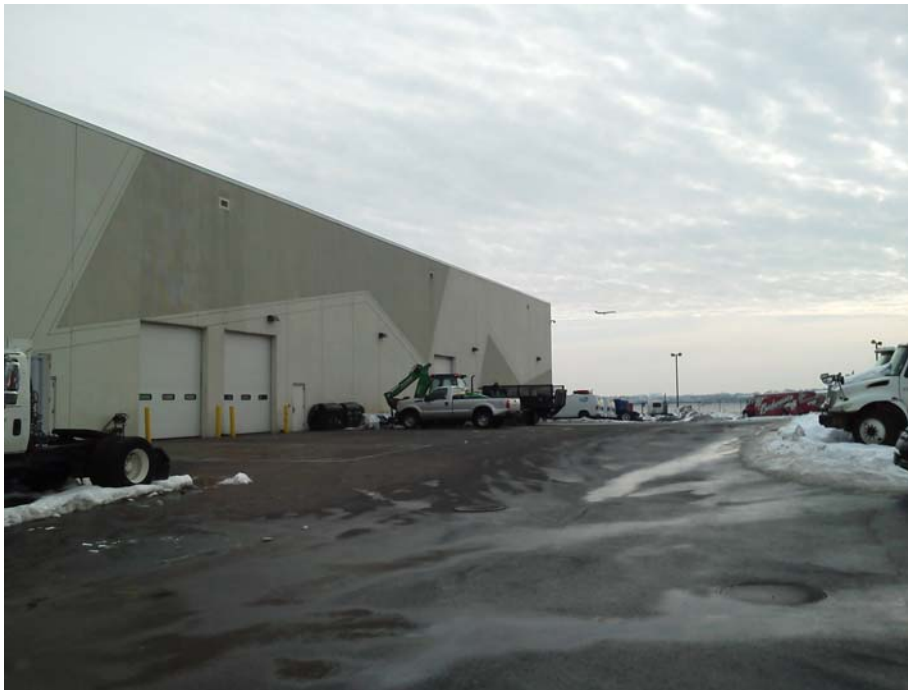
Photograph No. 2 – The southern entrance to Anheuser-Busch Distribution of Site C OU-1 (looking southeast)