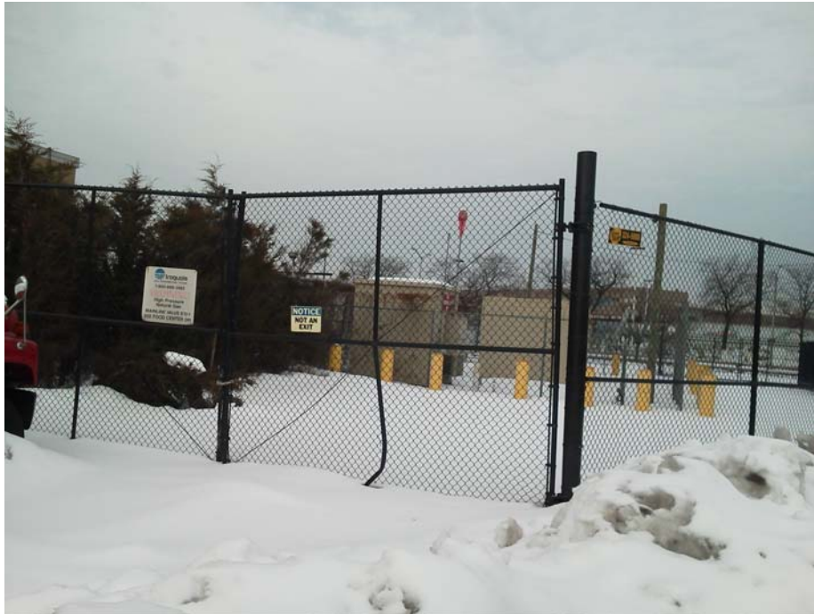
Photograph No. 5 - Iroquois Gas Pipeline monitoring station location on the Perimeter Site and Site C OU-1 (looking southwest)