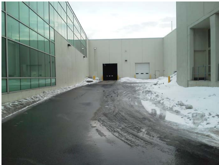
Photograph No. 10 – Site C OU-1 distribution truck exit from warehouse (looking southeast)