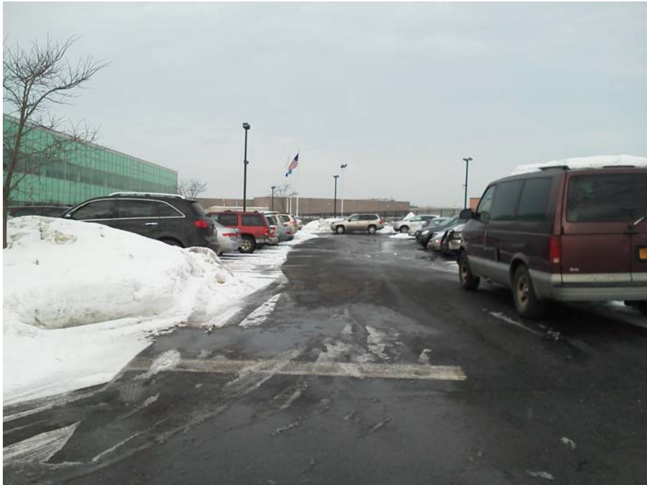
Photograph No. 13 – Site C OU-1 employee parking and office portion (looking west)