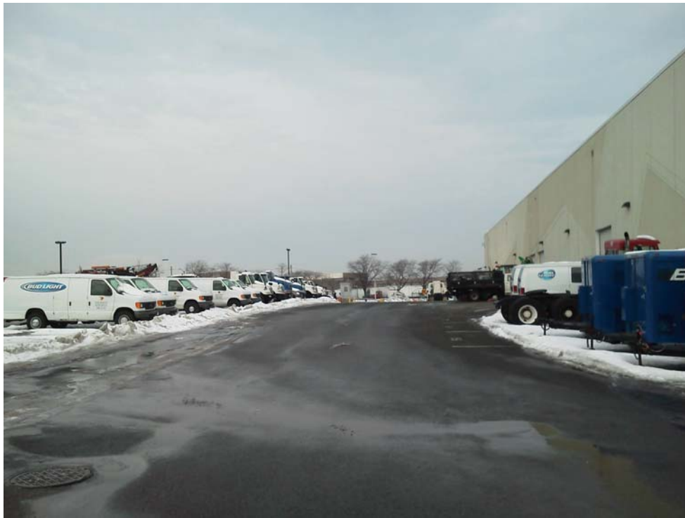
Photograph No. 8 – The southern parking lot of Anheuser-Busch Distribution of Site C OU-1 (looking northwest)