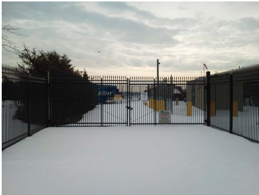
Photograph No.4 - Portion of Perimeter Site at entrance into Site C OU-1 (looking east-southeast)