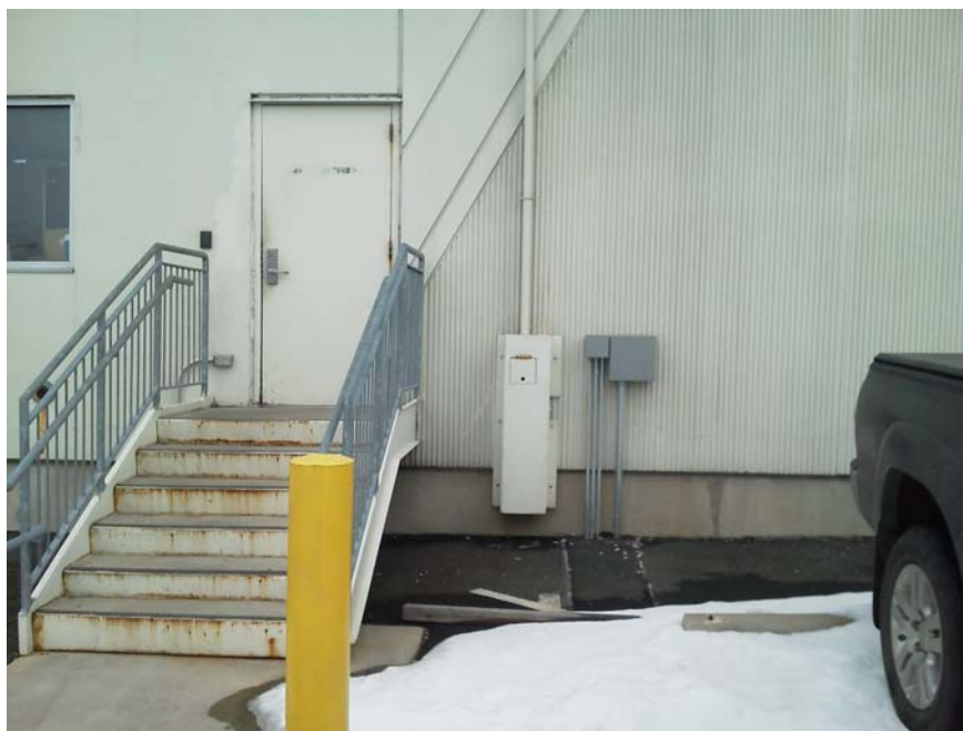
Photograph No. 16 – Southwest corner of warehouse at security entrance, passive sub-slab sampling port (looking northeast)