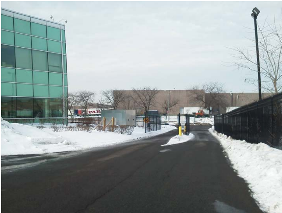
Photograph No. 14 – Site C OU-1 Northwest corner of offices, landscaped area, north locked entrance (looking west)