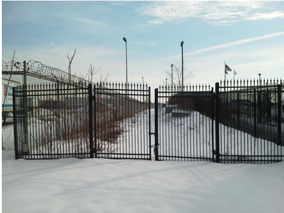
Photograph No. 17 – Site C OU-2 Greenway entrance (looking northeast)