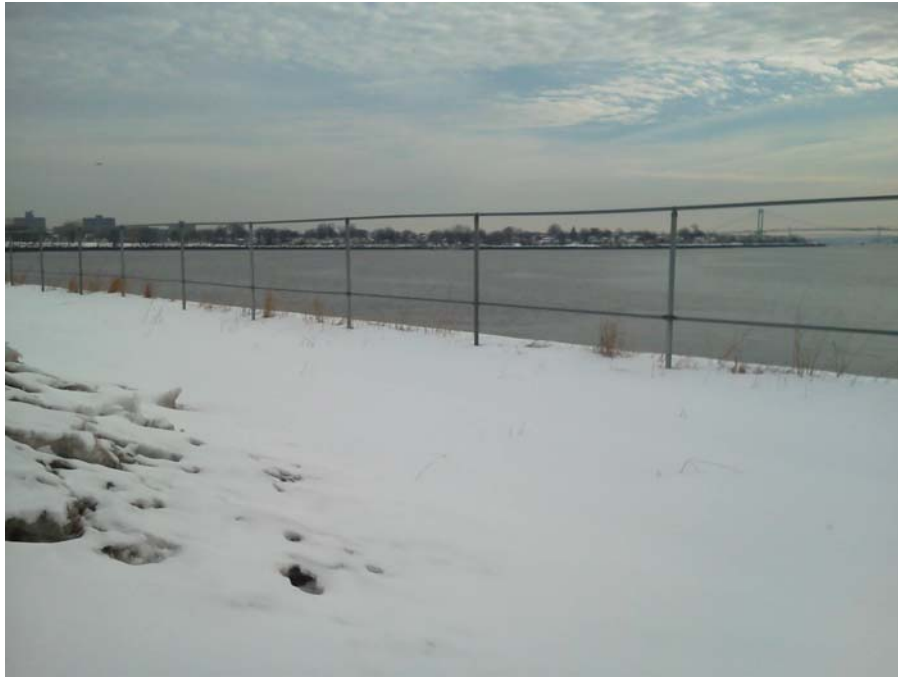
Photograph No. 21 – Site C OU-2 Greenway and river view (looking northeast)