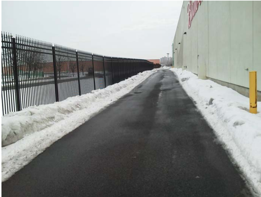
Photograph No. 9 – Site C OU-1 distribution truck exit drive from warehouse (looking northeast)