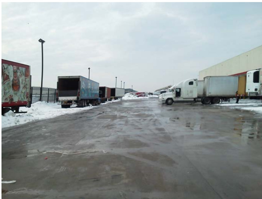
Photograph No. 12 – Rear trailer parking of AB Distribution at Site C OU-1 and Greenway Site C OU-2 (looking southwest)