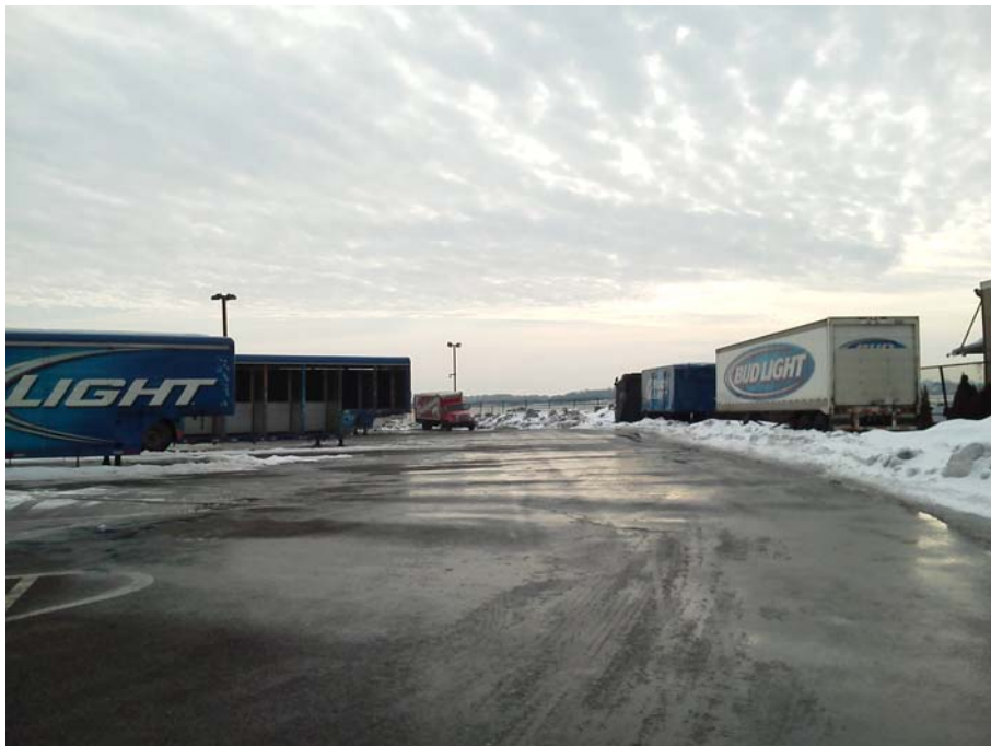
Photograph No. 6 - Portion of Perimeter Site extending into Site C OU-1 (looking east-southeast)