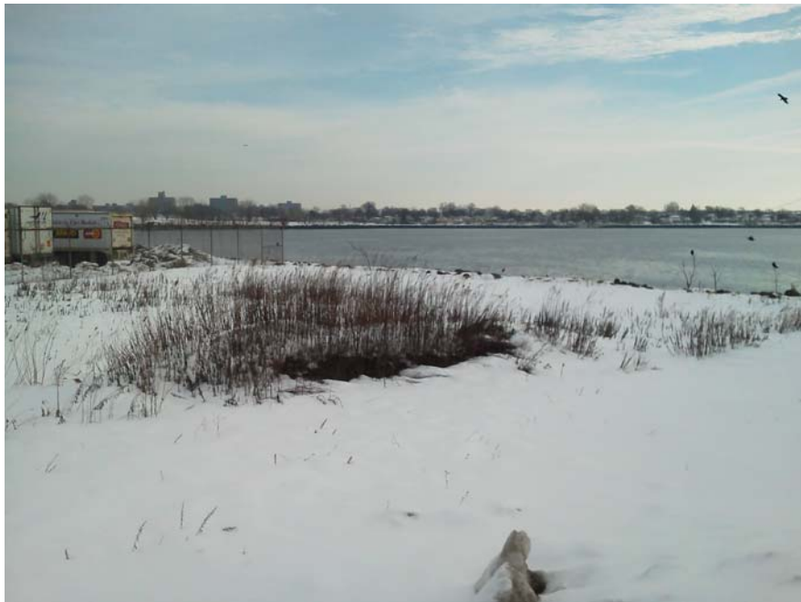
Photograph No. 20 – Site C OU-2 Greenway with Krasdale trucks, bulkhead and river view (looking north)