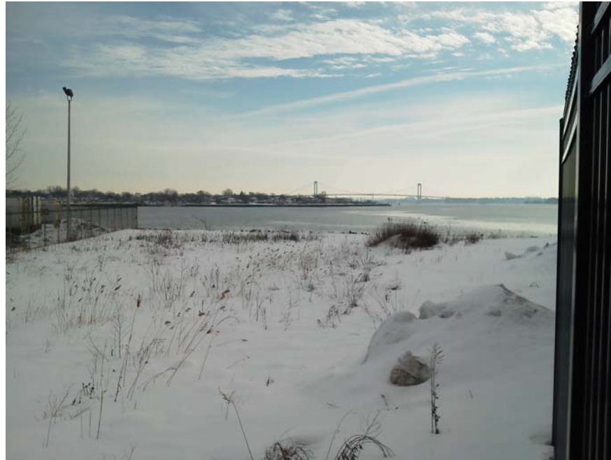
Photograph No. 19 – Site C OU-2 Greenway with Krasdale trucks and river view (looking east)