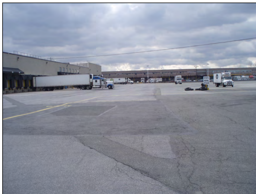
Photograph No. 8 – Site E OU-1: Typical Patch of Asphalt Cap Site Wide.