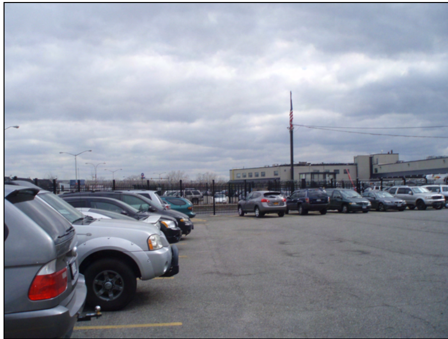
Photograph No. 9 – Site E OU-1: Previously Installed (2009) Aluminum Fencing (looking east)