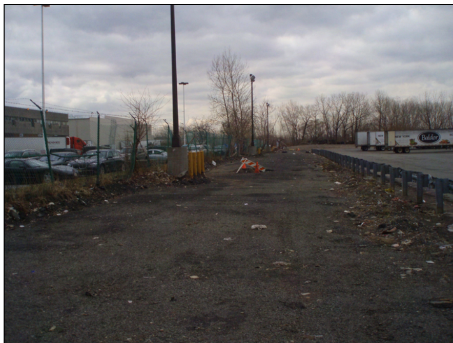
Photograph No. 4 – Site E OU-1: Southern perimeter and NYCDEP sewer/stormwater easement (looking west)