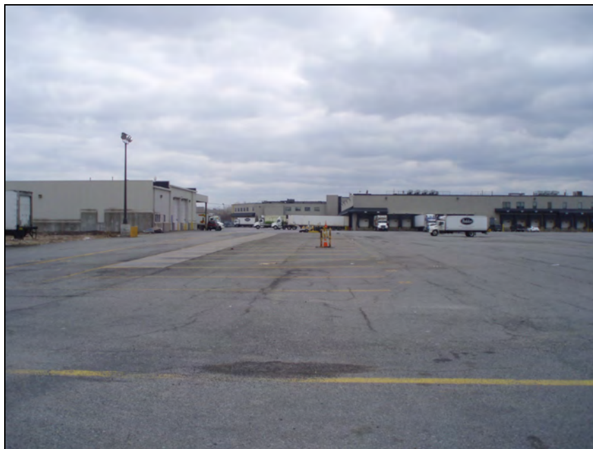
Photograph No. 1 – Site E OU-1: View from the eastern edge parking lot of the site (looking east)