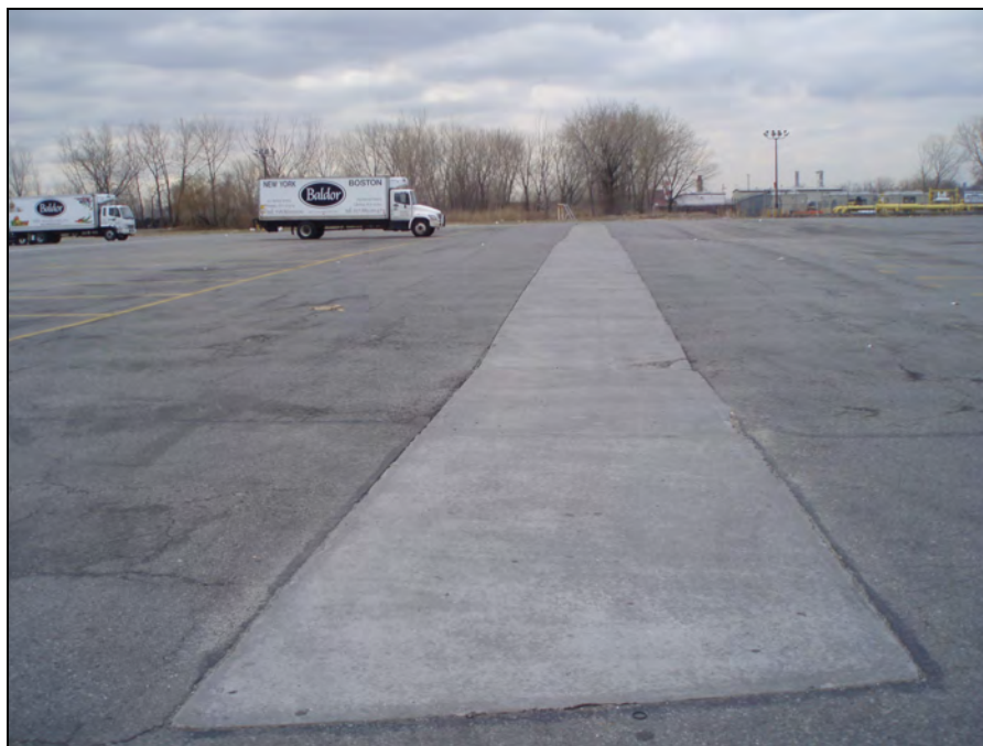
Photograph No. 2 – Site E OU-1: View from the southern edge of site (looking west)