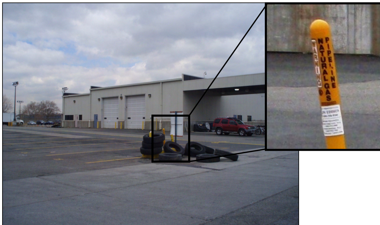
Photograph No. 7 – Site E OU-1: Marker for Consolidated Edison of New York easement and 24-inch gas line and saw-cut asphalt associated with gas line-installation and maintenance (looking north-northwest)