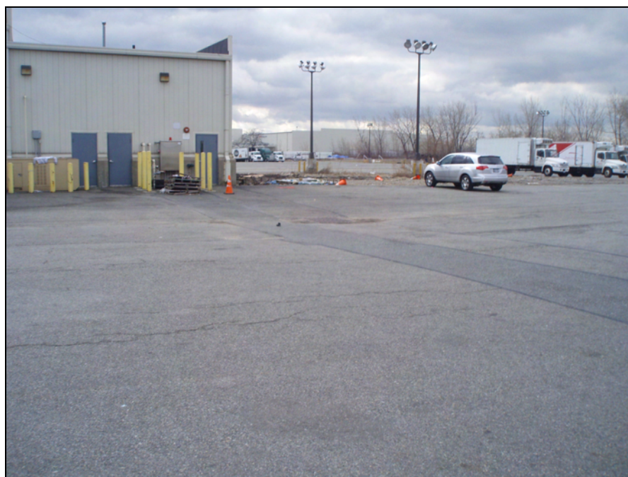
Photograph No. 6 – Site E OU-1: Incomplete construction of truck maintenance building expansion (looking southwest)