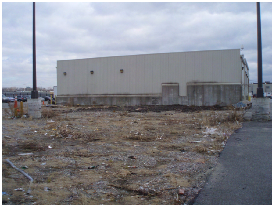
Photograph No. 5 – Site E OU-1: Incomplete construction of truck maintenance building expansion (looking northeast)