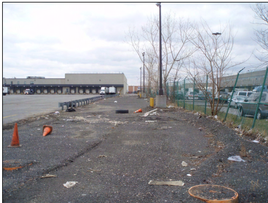
Photograph No. 3 – Site E OU-1: Southern perimeter and NYCDEP sewer/stormwater easement (looking east)