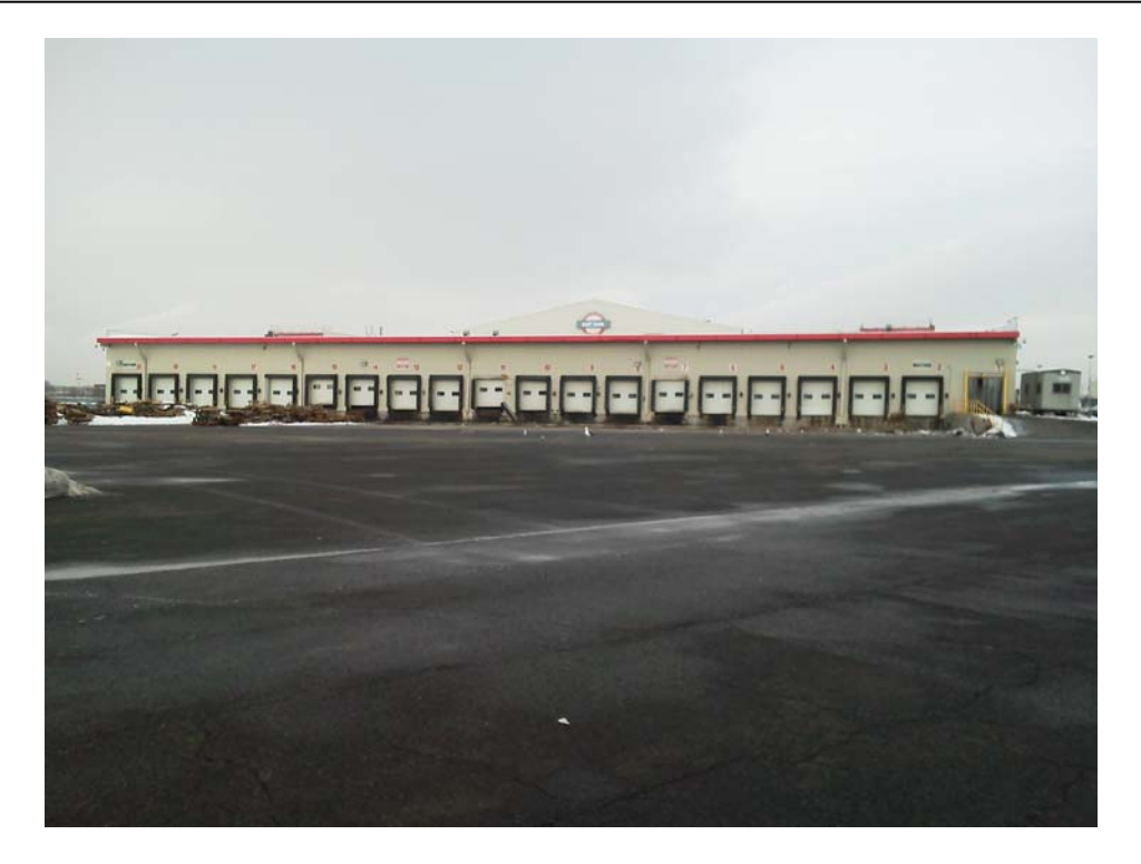
Photograph No. 1 – The New Fulton Fish Market southern parking portion of Site B (looking northwest)