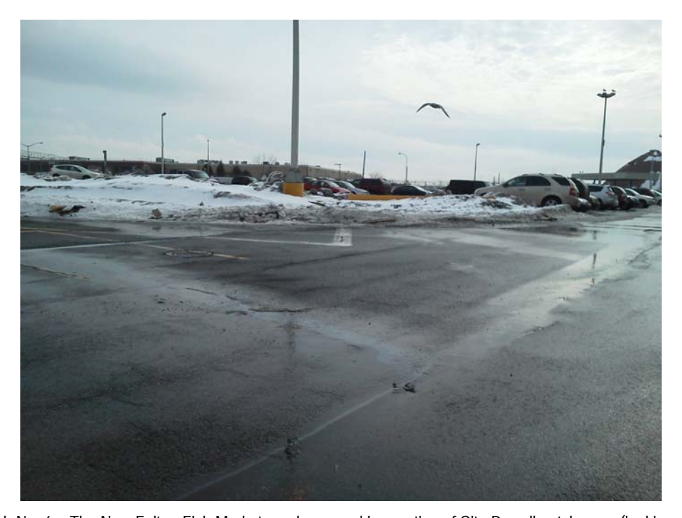
Photograph No. 6 – The New Fulton Fish Market employee parking portion of Site B, well patch seen (looking southeast)