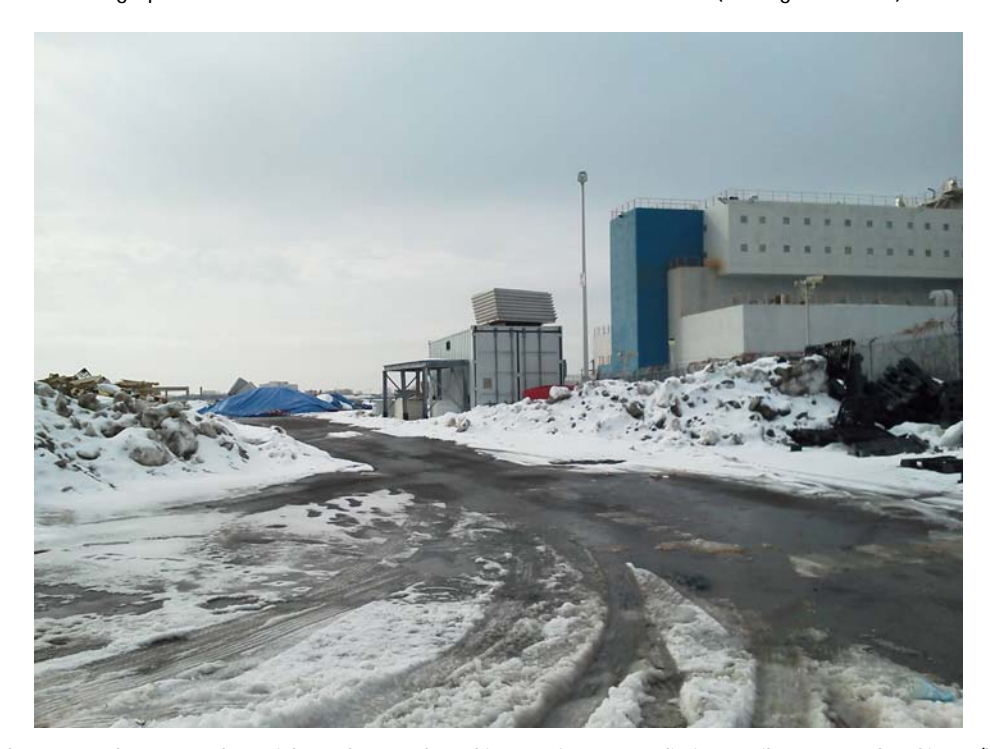
Photograph No. 8 – The New Fulton Fish Market south parking portion, Remediation Trailer Removal at Site B (looking south)