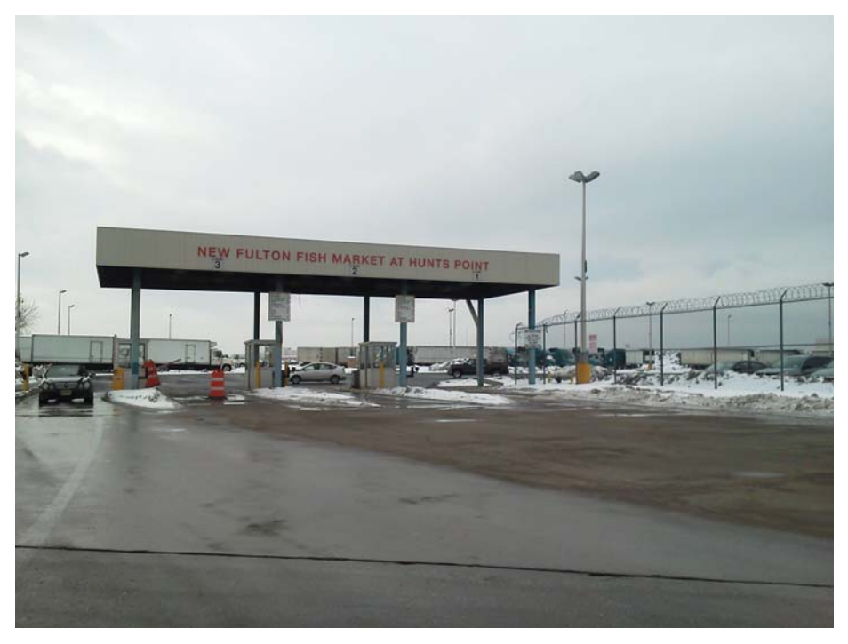
Photograph No. 7 – The New Fulton Fish Market entrance at Site B (looking southwest)