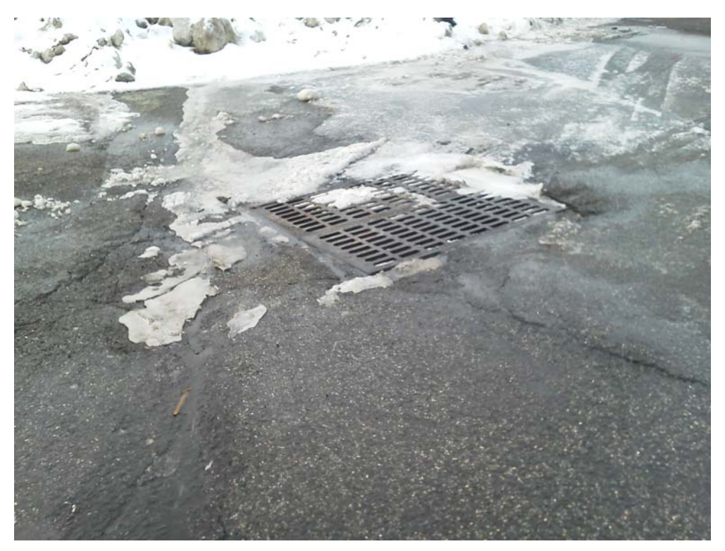
Photograph No. 9 – The New Fulton Fish Market southwest parking portion, one of the remaining Catch Basins for repair