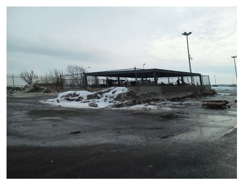
Photograph No. 5 - The New Fulton Fish Market northeast parking portion storage of Site B (looking southwest)