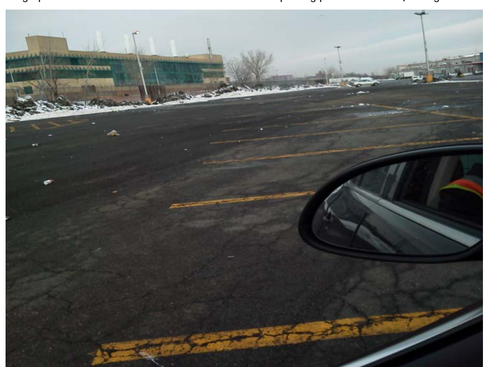
Photograph No. 2 – The New Fulton Fish Market western parking portion of Site B (looking northwest)