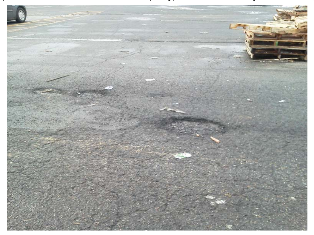
Photograph No. 10 – The New Fulton Fish Market southwest parking portion, example of a pothole.