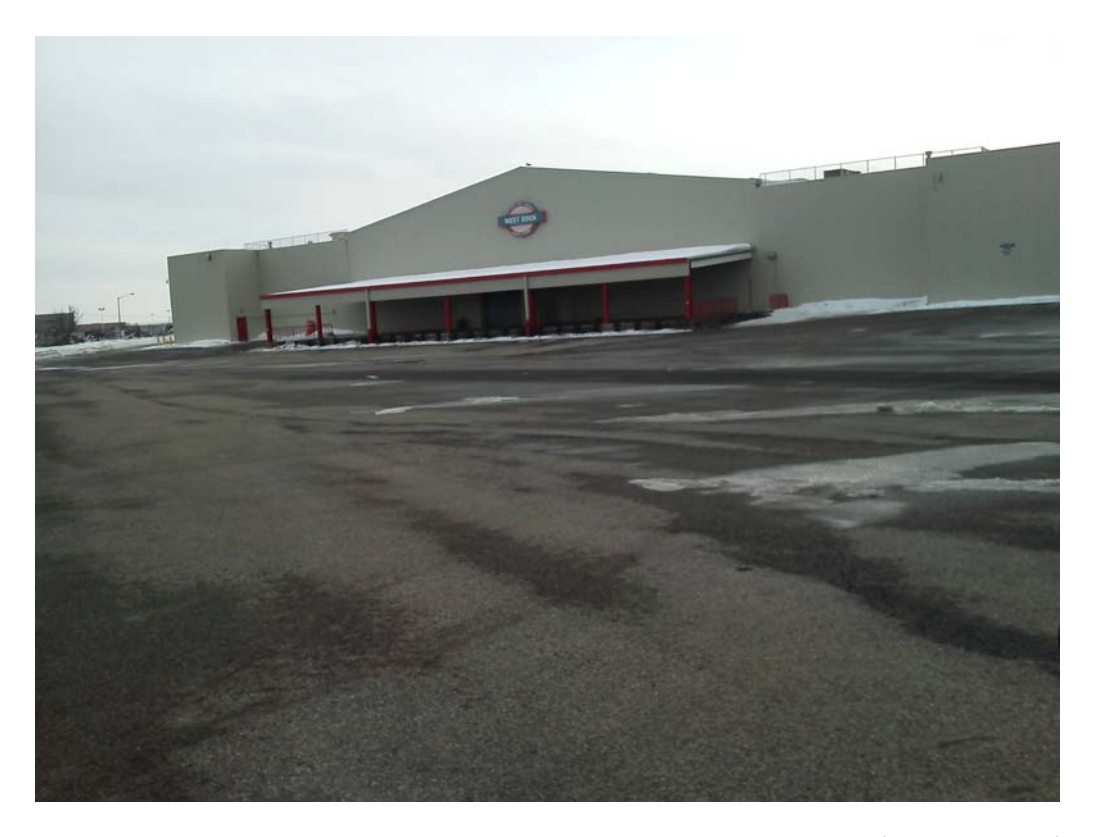
Photograph No. 3 – The New Fulton Fish Market northwestern parking portion of Site B (looking southeast)