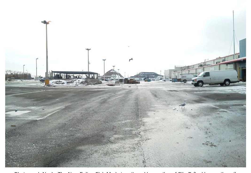
Photograph No.4 - The New Fulton Fish Market north parking portion of Site B (looking southeast)