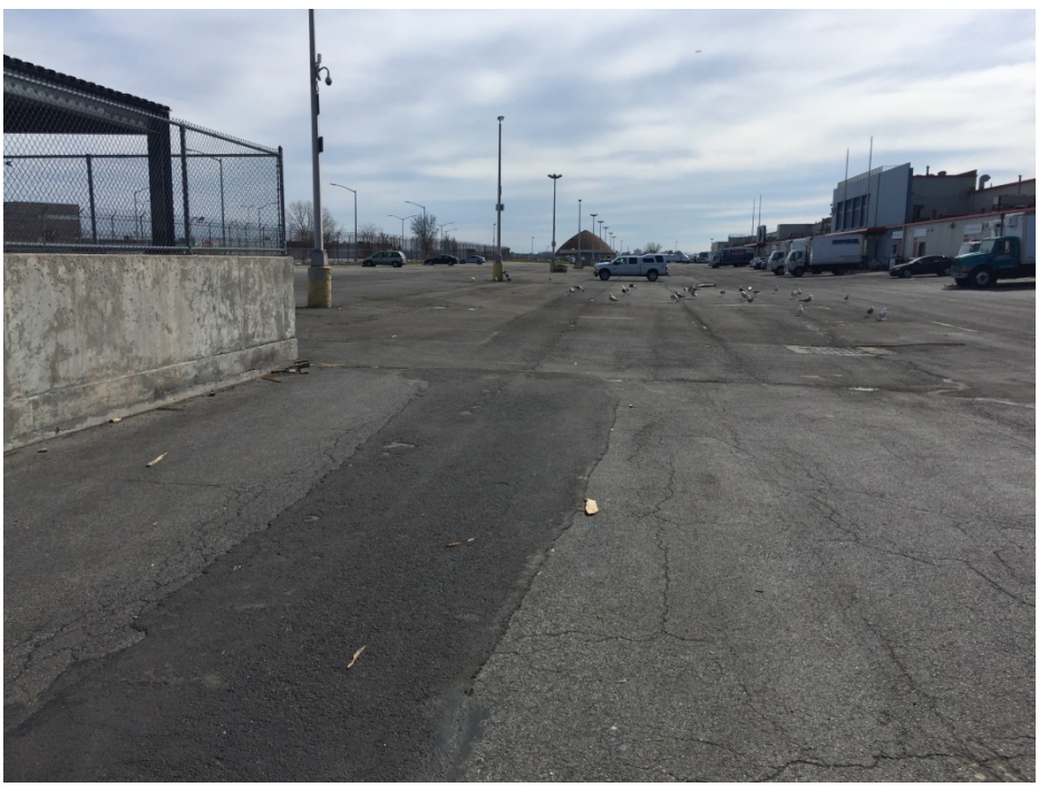
Photograph 8 – New Fulton Fish Market example of interim winter repair (looking southeast)