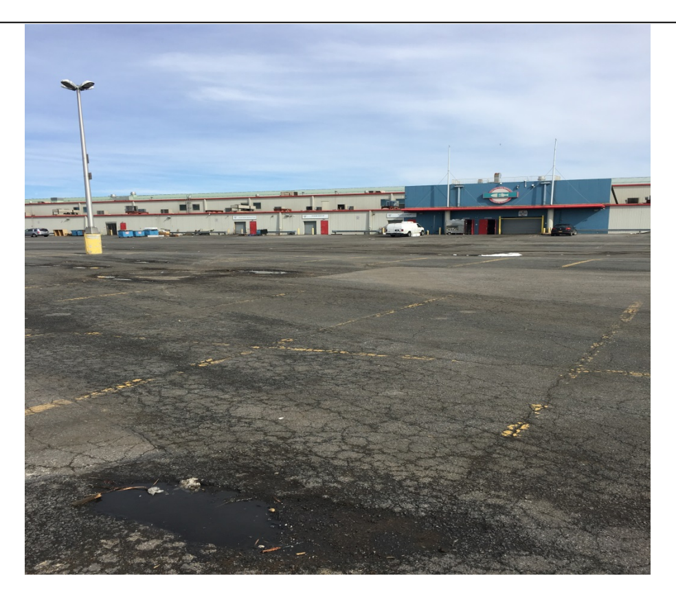
Photograph 3 – The New Fulton Fish Market Southern Parking Lot, example of asphalt area with deterioration that will be repaired (looking northeast)