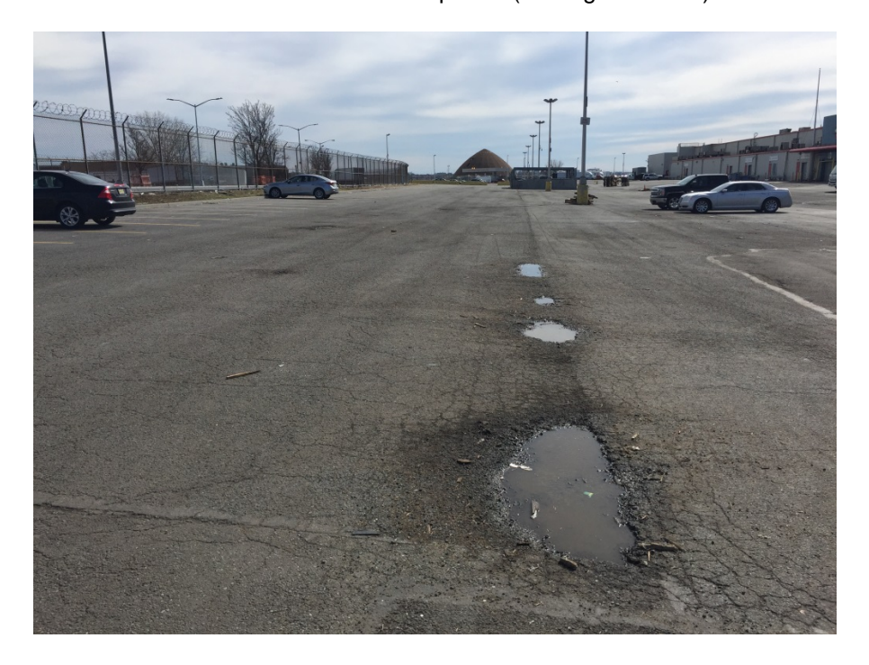
Figure 4 – New Fulton Fish Market northern roadway (looking east) Potholes visible.