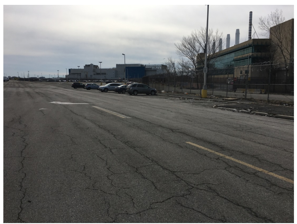
Photograph 2 – The New Fulton Fish Market Western Parking Lot (looking south)