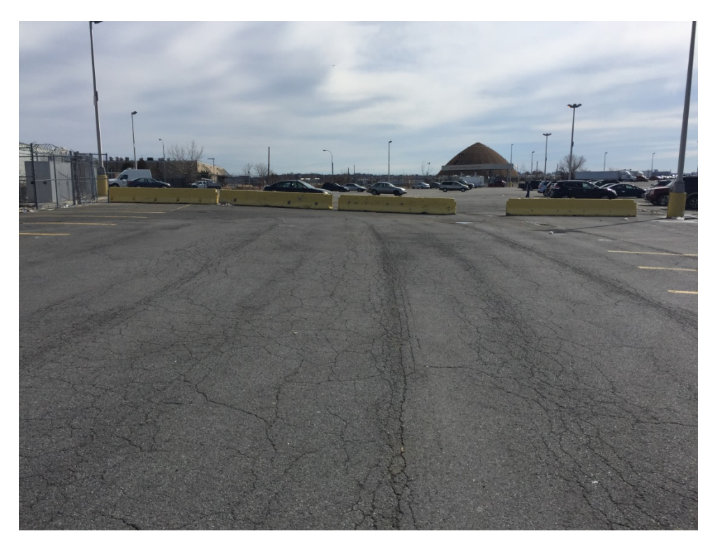
Photograph 1 – New Fulton Fish Market truck staging area/eastern parking lot (looking southeast)