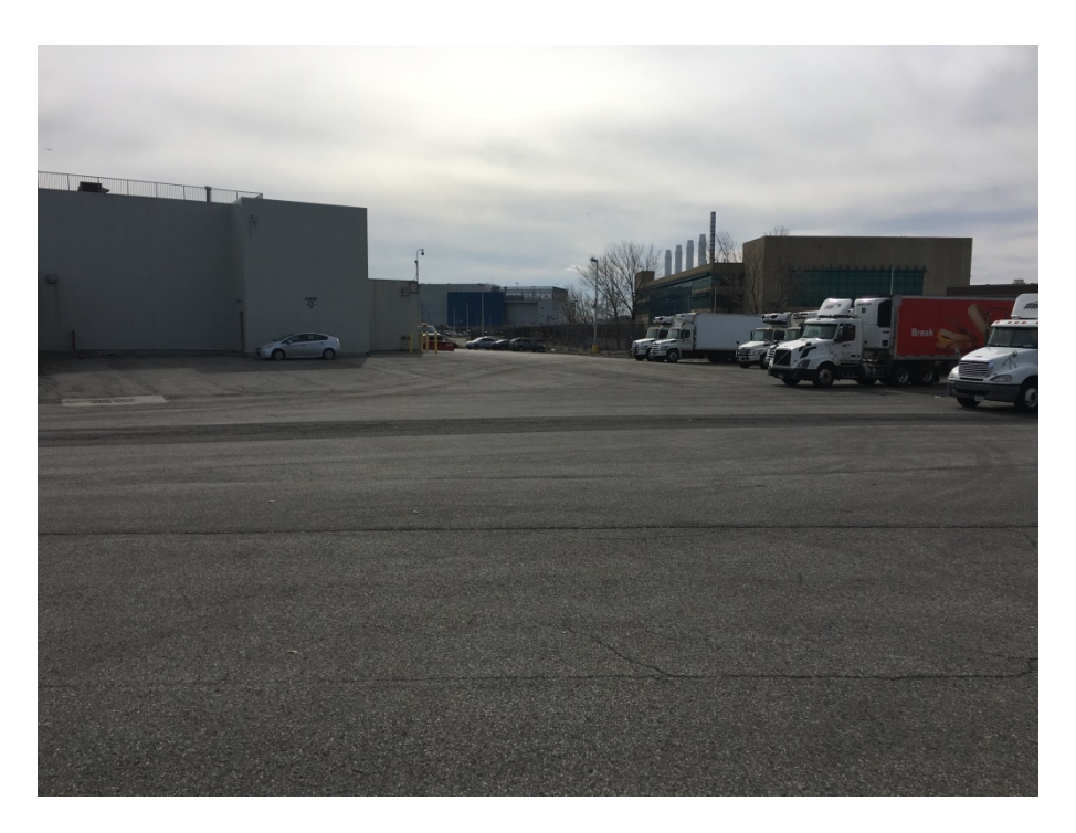
Photograph 6 – New Fulton Fish Market example of catch basin that was repaired (looking southwest)