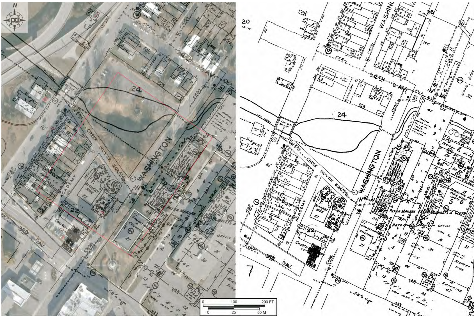
Figure 2.6. 1949 Sanborn map overlain on a recent aerial photograph of the project area.