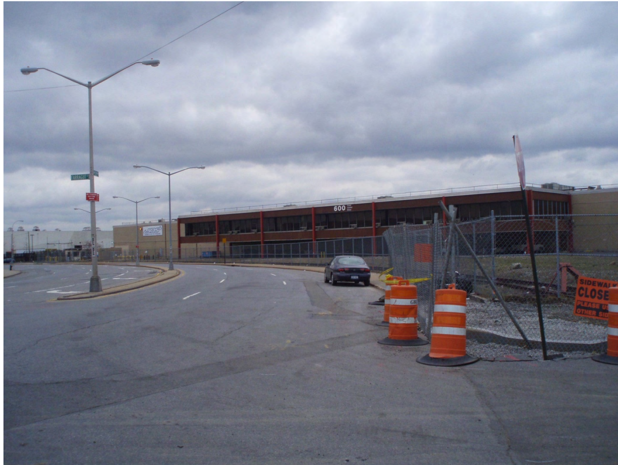
Photograph No. 1 – Southern terminus of Perimeter Site at southeast corner of intersection with Food Center Drive and Farragut Street (looking northeast) Note: Construction in this photograph is outside of the Metes & Bound of the VCA. Construction is associated with the Farragut Street Park Project.