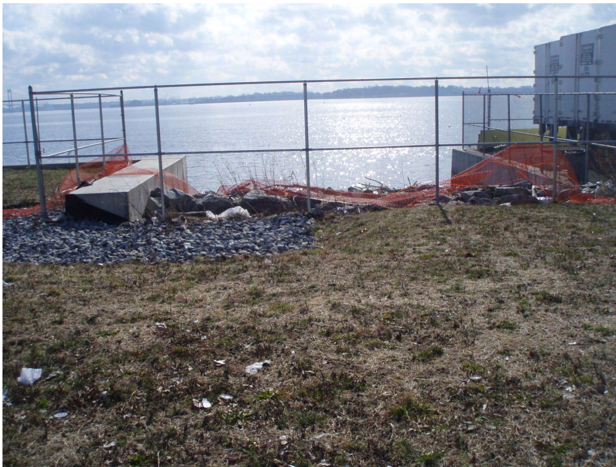
Photograph No. 13 – Portion of Perimeter Site extending into Site C OU-2 (looking east-southeast)