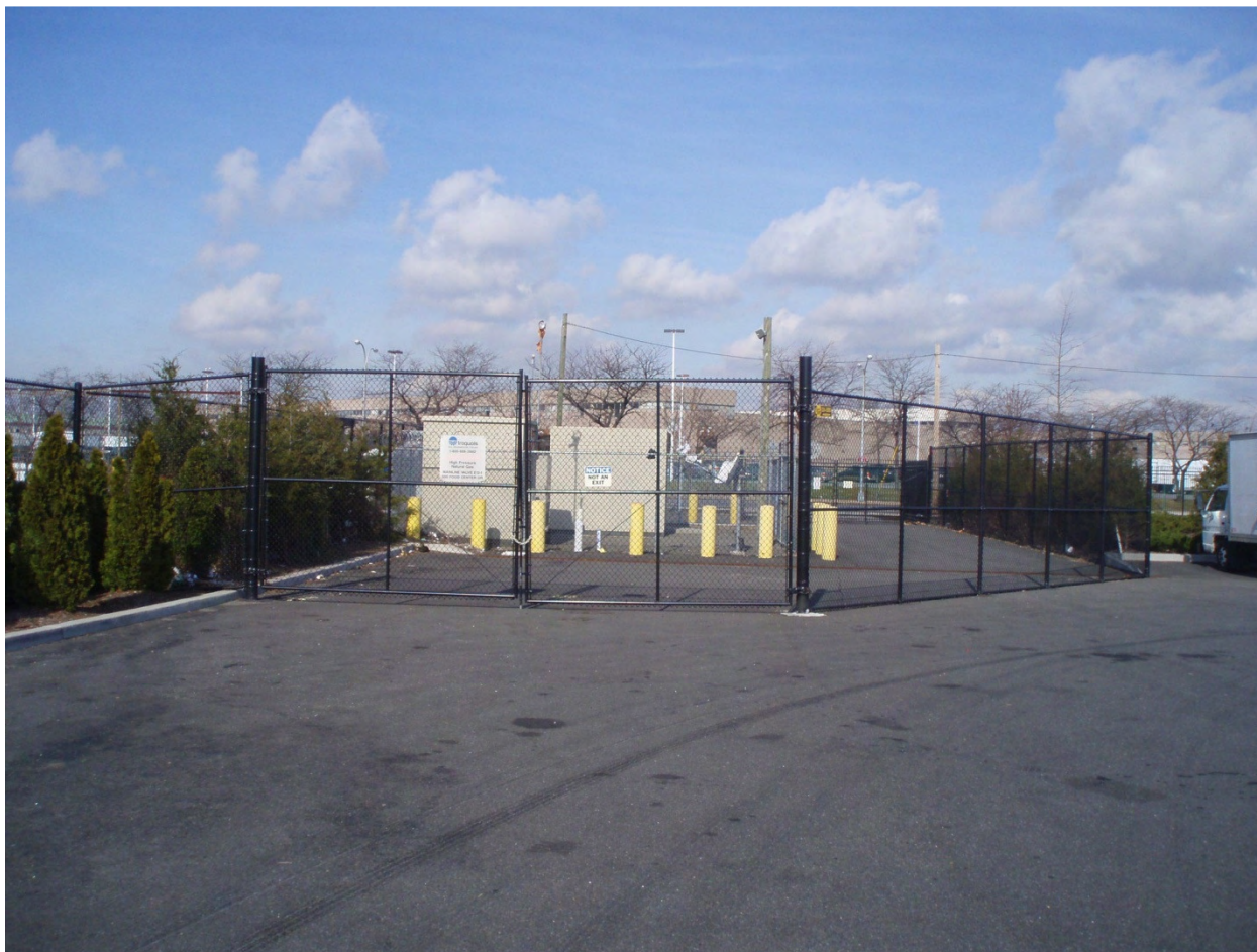
Photograph No. 11 –Iroquois Gas Pipeline monitoring station location on the Perimeter Site and Site C OU-1 (looking southwest)