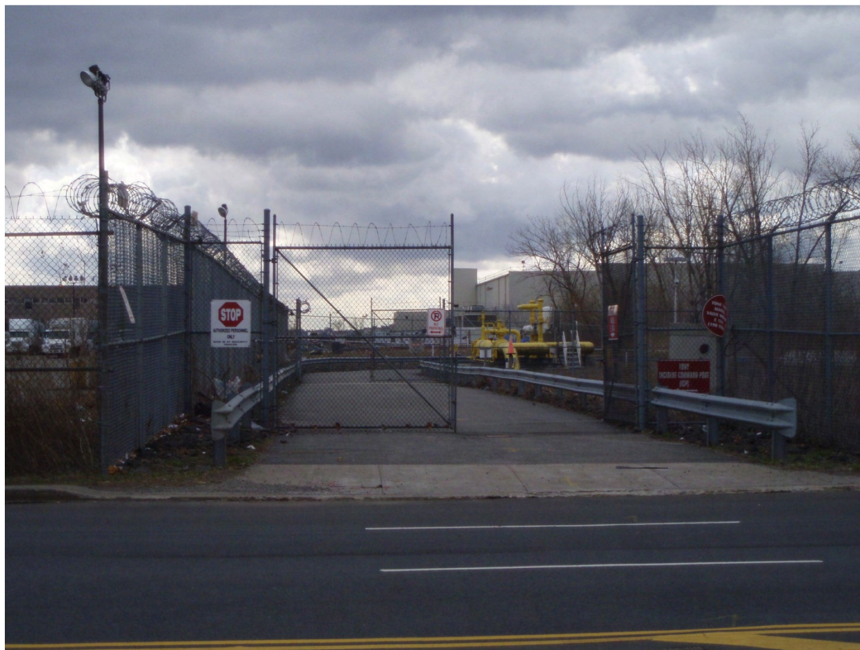
Photograph No. 9 –Portion of Perimeter Site at entrance into Site E OU-2 (looking south)