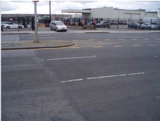
Photograph No. 6 – Northern portion of Perimeter Site, new asphalt covering at Baldor gate entrance into Site E OU-1 (looking south)