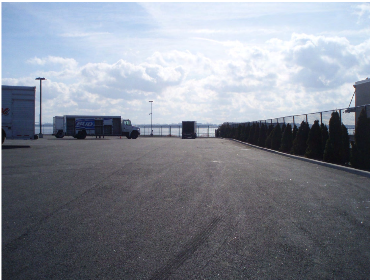
Photograph No. 12 –Portion of Perimeter Site extending into Site C OU-1 (looking east-southeast)