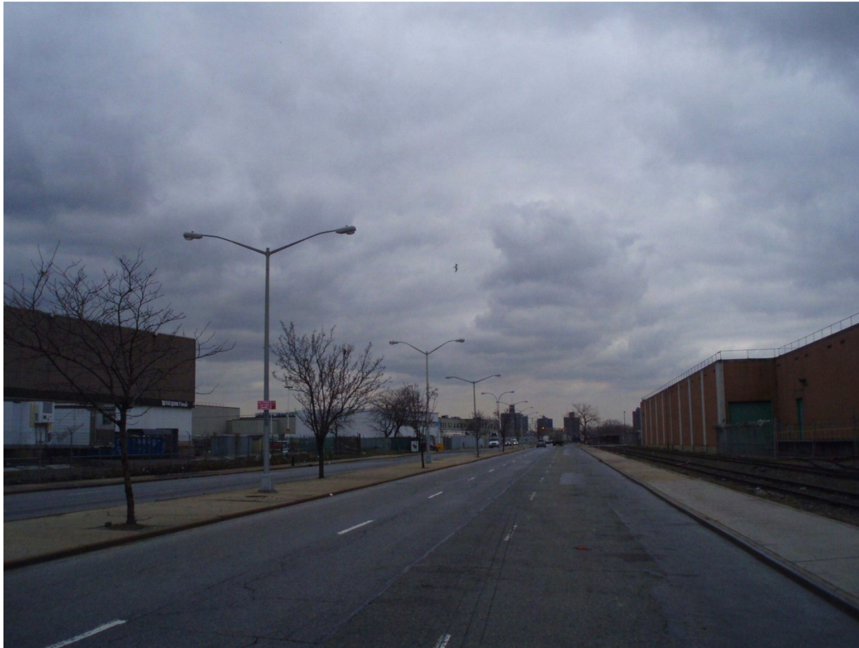
Photograph No. 3 – Southern Portion of Perimeter Site, Food Center Drive (looking northeast)