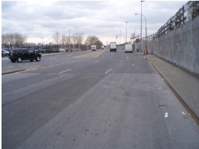
Photograph No. 5 – Northern portion of Perimeter Site, cutting across Food Center Drive into Site E OU-1 (looking west)