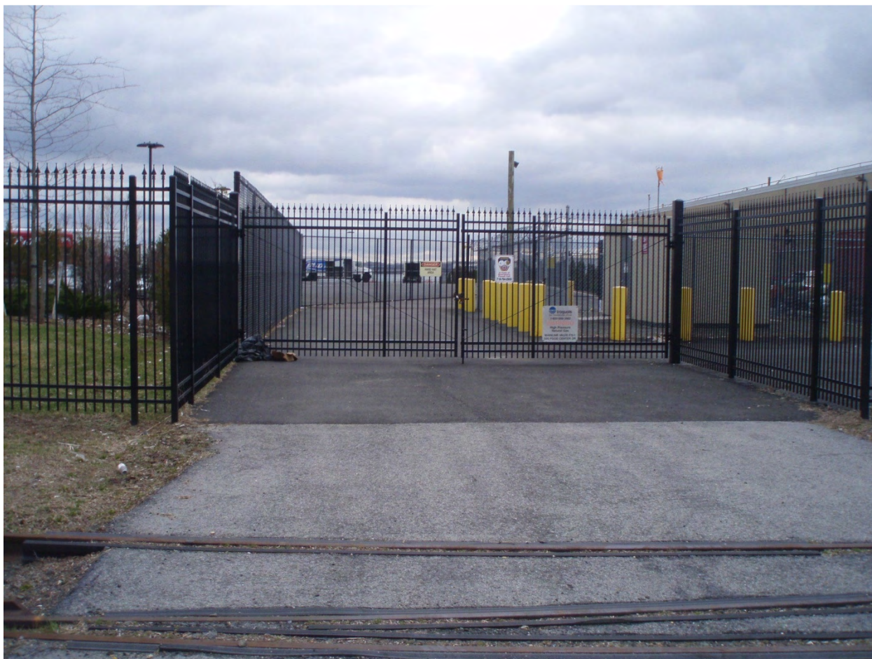
Photograph No. 10 –Portion of Perimeter Site at entrance into Site C OU-1 (looking east-southeast)