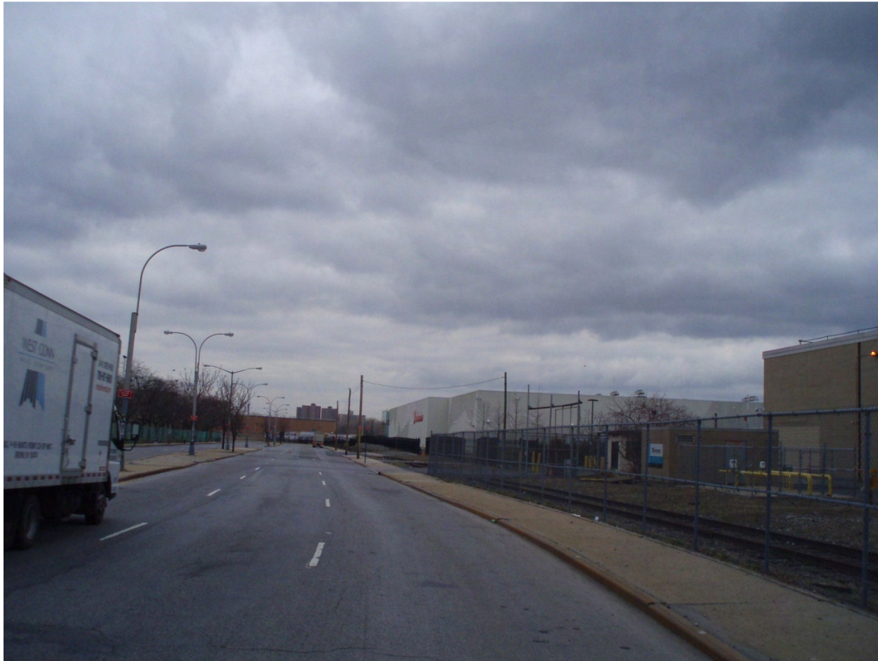
Photograph No. 2 – Southern portion of Perimeter Site, Food Center Drive (looking northeast)