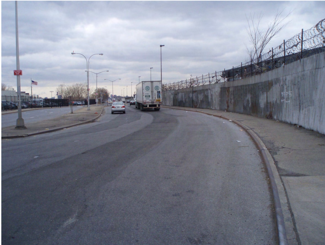
Photograph No. 4 – Northern portion of Perimeter Site, Food Center Drive (looking west)