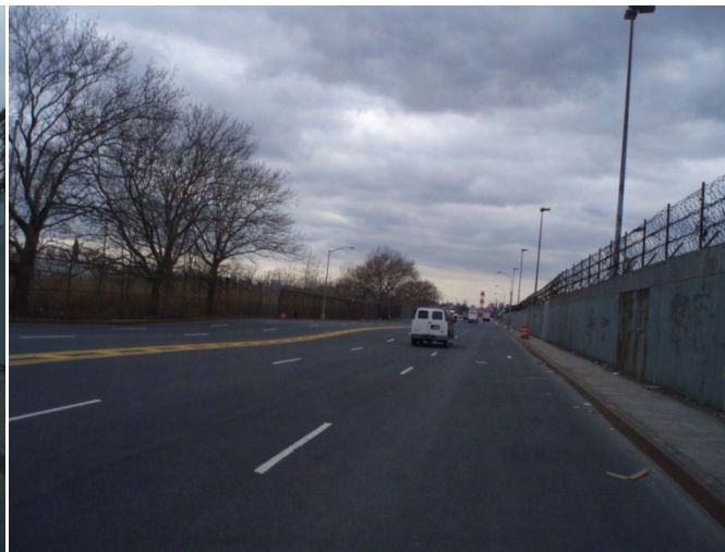
Photograph No. 8 – Northern portion of Perimeter Site, cutting across Food Center Drive into Site E OU-2 (looking west)