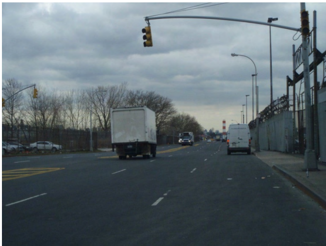
Photograph No. 7 – Northern portion of Perimeter Site, cutting across Food Center Drive into Site E OU-1 (looking west)