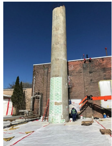
Asbestos abatement work on a stack at the site prior to demolition.

Please see the map for the site location. Documents related to the cleanup of this site can be found at the location(s) identified below under "Where to Find Information."