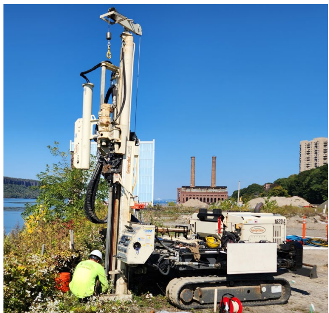
Example of drill rig