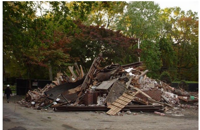
55 Hillandale Post Demolition

In 2004, EPA conducted an emergency response at the site to remove visible mercury observed near a rock pile, adjacent to the asphalt walking path on the Arbors condominium property. EPA also collected surface soil samples from around the walking path to delineate the extent of mercury contamination. EPA expanded their investigation after mercury was found in the soil of neighboring properties, beyond