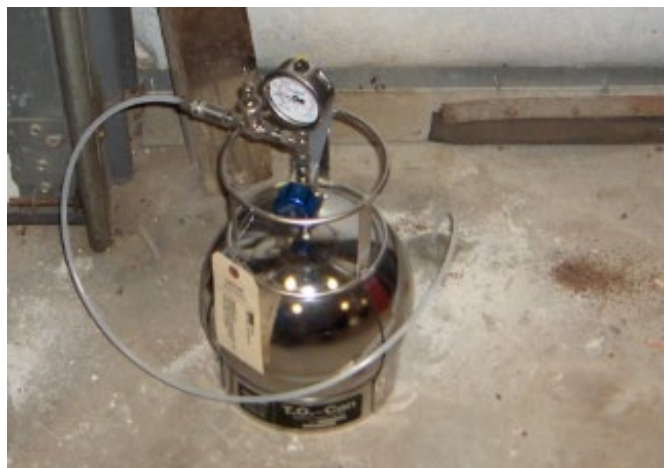
Example of air sampling canister