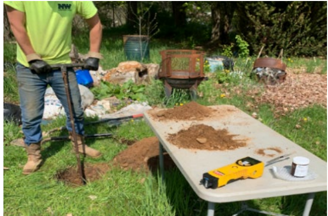
Example of hand auguring equipment

After review of soil and groundwater data, DEC may, if necessary, request access from property owners to collect indoor and outdoor air samples on their property. Air samples will be collected and sent to an environmental laboratory for analysis and data evaluation.