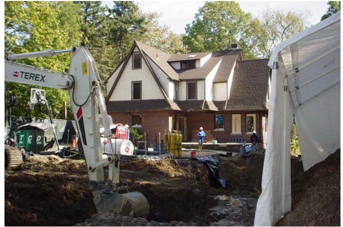
55 Hillandale Pre Demolition

replace contaminated soil and to return the site to the original grade.