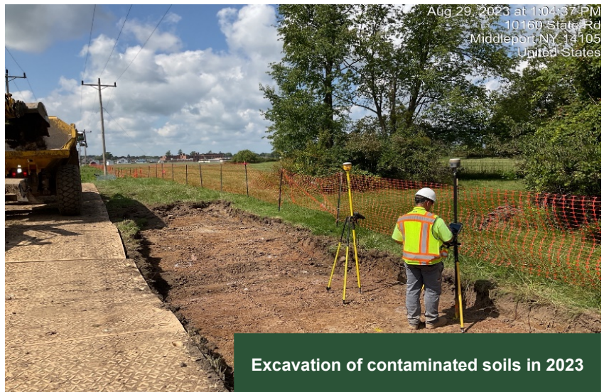
Excavation of contaminated soils in 2023

FMC Corporation (FMC) is continuing the multi-year cleanup of properties nearby and adjacent to the FMC facility (Site No. 932014) located at 100 Niagara Street in Middleport, Niagara County. The New York State Department of Environmental Conservation (DEC) is overseeing the comprehensive cleanup of arsenic and other contamination by FMC that complies with requirements in the May 2013 Final Statement of Basis for Air Deposition Area #1 (2013 FSOB) and a 2019 consent order between the parties. These documents specify the required cleanup activities, which include removal of impacted soil from residential and commercial parcels in the community, called Operable Units or OUs (OU2 and OU5), and from the Royalton-Hartland Central School District (Roy-Hart) Middleport campus (OU4). The DEC selected remedy includes removal of arsenic in soils to levels that meet state health and environmental guidelines and, when removal is not an option, implementing actions to prevent potential public exposure.