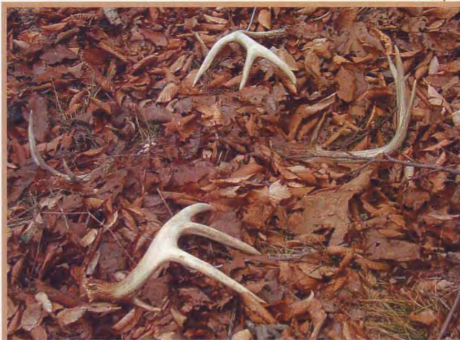
Sheds are more visible when the tines point down.

I have spent many hours looking for the "other" antler since that first find. Finding pairs is rare, and if found, they will probably be lying side by side. Only twice have I found pairs of antlers that were not shed in the same place.