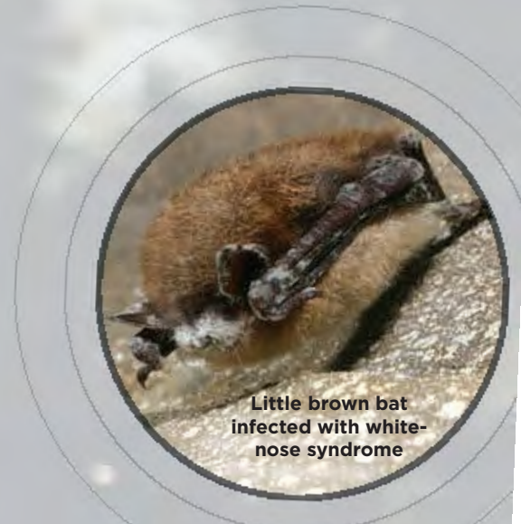
Little brown bat infected with white-nose syndrome