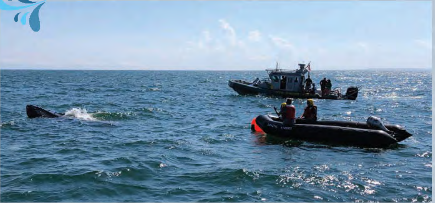
The team working together to assess the whale's condition and the entanglement.

joined by three specialists from the CCS disentanglement team at the Jones Beach State Park Boat Basin dock, and the joint team traveled to the animal's position.