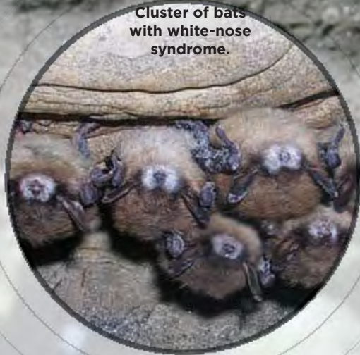
Cluster of bats with white-nose syndrome.

“A December 2019 study, co-authored by Herzog, concluded that little brown bats may be developing a resistance to the fungal infection.”