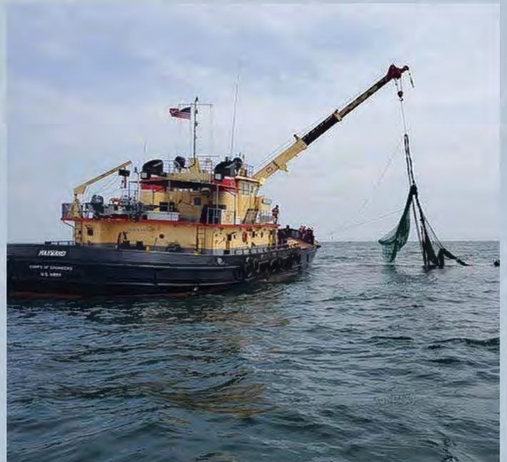
One of the five vessels used to free the ensnared whale.

was happy to have the extra help, there were concerns regarding the weight of the gear and the potential limitations of the vessel. So after consulting with AMSEAS, DEC officers on the Fitz put a contingency plan into action and sent a request for vessel support from the U.S. Army Corp of Engineers at Caven Point, NJ. The Army Corp immediately responded that they would send their 124-foot vessel, the Hayward , to assist. Meanwhile, the