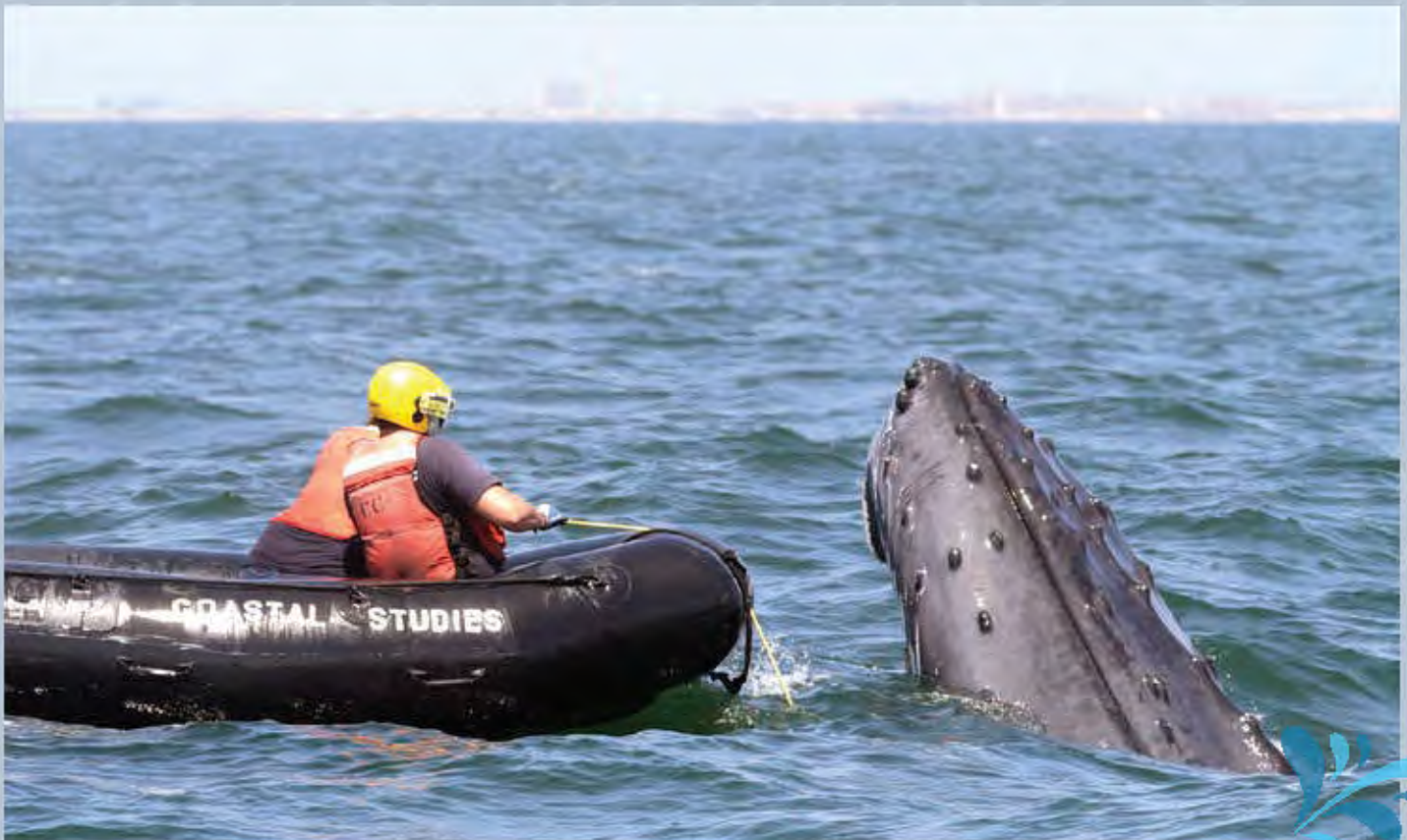
After working for four days, the team freed the humpback whale from the almost 2 tons of fishing gear that had ensnared it.