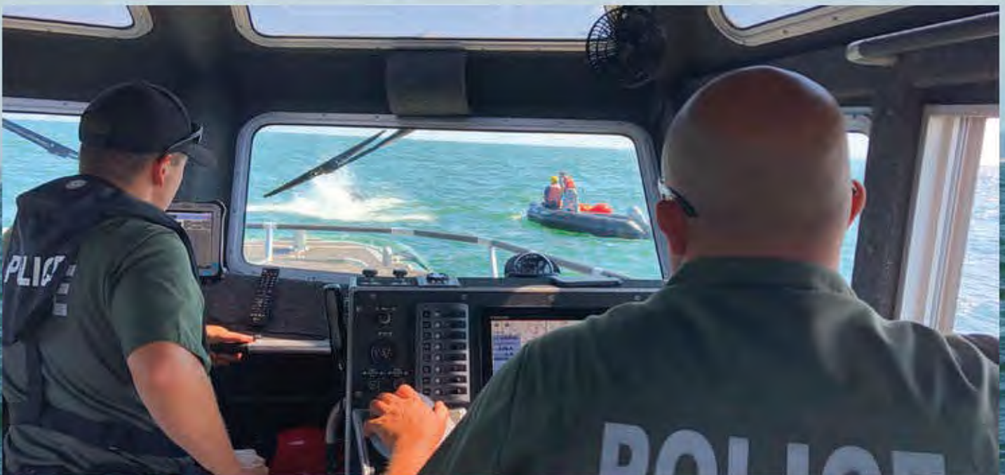
DEC Environmental Conservation Police Officers (ECOs) joined a team to free a humpback whale that had become entangled by fishing gear and anchored to the bottom of the Ambrose Channel.

This information was shared with the CCS disentanglement team, and plans were made for the team's arrival the following day. The response effort comprised three DEC vessels equipped with one small inflatable boat and a motor brought by CCS. The AMSEAS team was