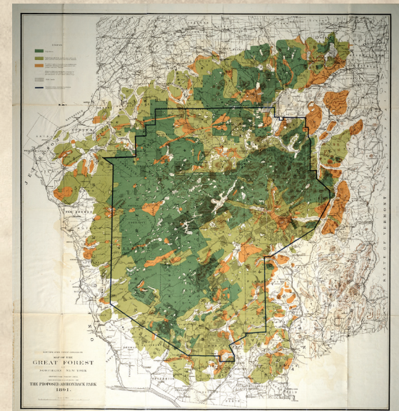
MAP OF THE ADIRONDACK PARK, 1891

The Sargent Commission created two more historically significant maps of the Great Forest of Northern New York (the Adirondacks). The first (1890) shows forest preserve areas outlined in red, and the proposed park outlined in blue. The second (1891) shows a slightly different park proposal outlined in blue.