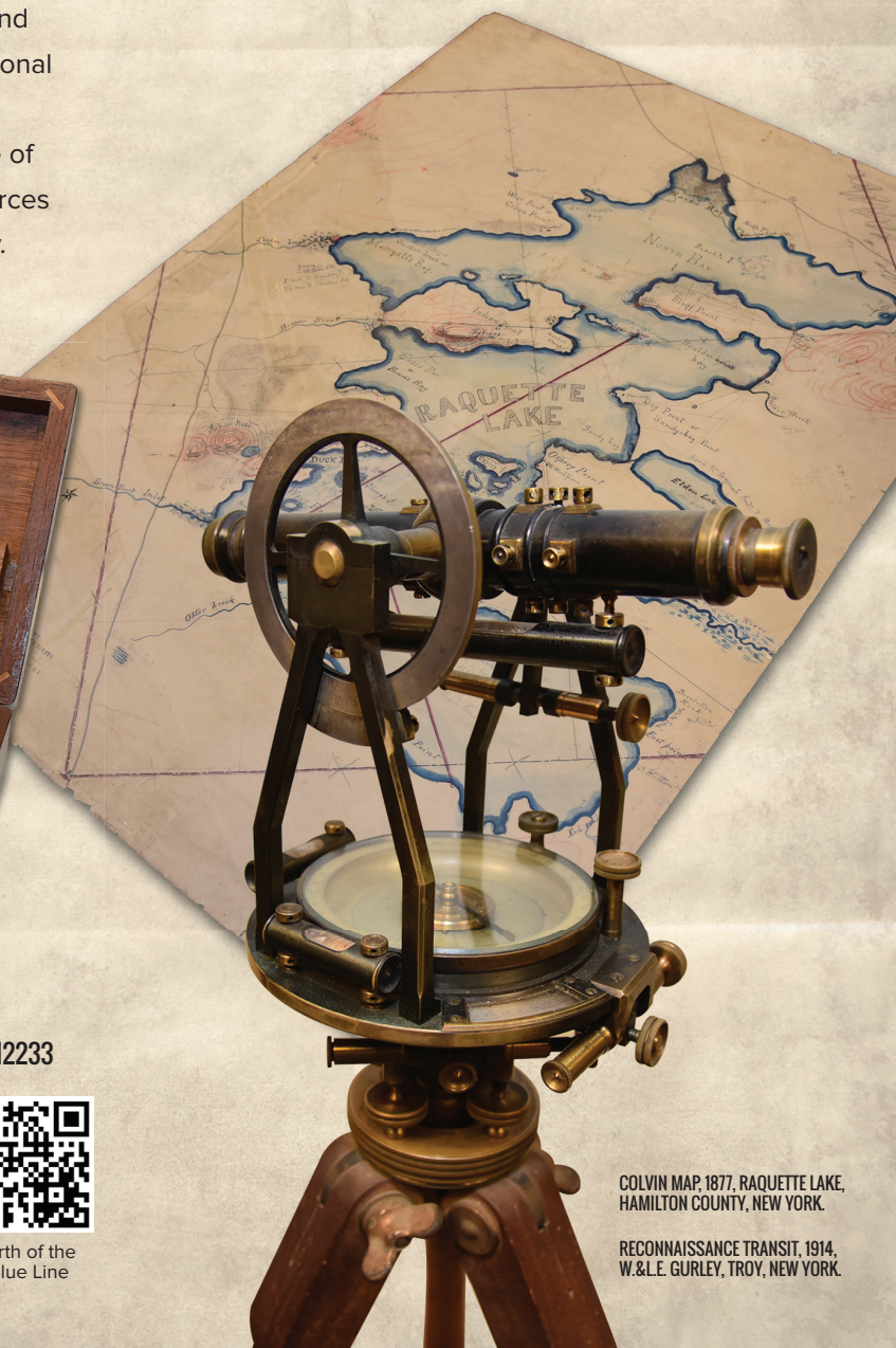
COLVIN MAP, 1877, RAQUETTE LAKE, HAMILTON COUNTY, NEW YORK.