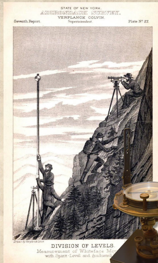
POCKET RAILROAD COMPASS WITH TELESCOPIC SIGHT ATTACHMENT, CIRCA 1884-1916, W.&L.E. GURLEY, TROY, NEW YORK.

law, on May 15, 1885, creating the Adirondack and Catskill Forest Preserve. The law required that all state lands in eleven Adirondack and three Catskill counties "be forever kept as wild forest lands."