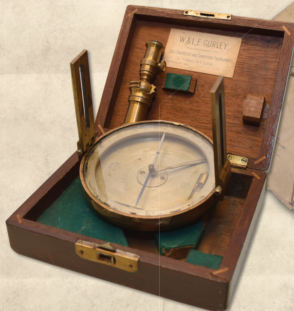
VERNIER POCKET COMPASS, CIRCA 1900, W.&L.E. GURLEY, TROY, NEW YORK.

VISIT EXHIBIT AT NYS DEC, 625 BROADWAY, ALBANY, NY 12233