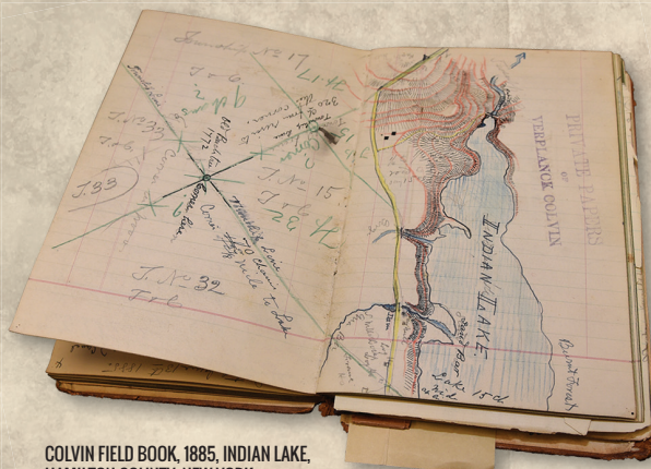
COLVIN FIELD BOOK, 1885. INDIAN LAKE, HAMILTON COUNTY, NEW YORK.

In a special report to the Legislature, dated January 1891, the Sargent Commission recommended obtaining a state park in the Adirondacks of from 50 to 70 miles square. They recommended buying land instead of taking it by eminent domain. They wrote, “Nobody imagines that this commission, or any other representative of the State, can call an Adirondack Park into existence by the touch of a wand. Its formation must necessarily be progressive and the acquisition of lands gradual.”