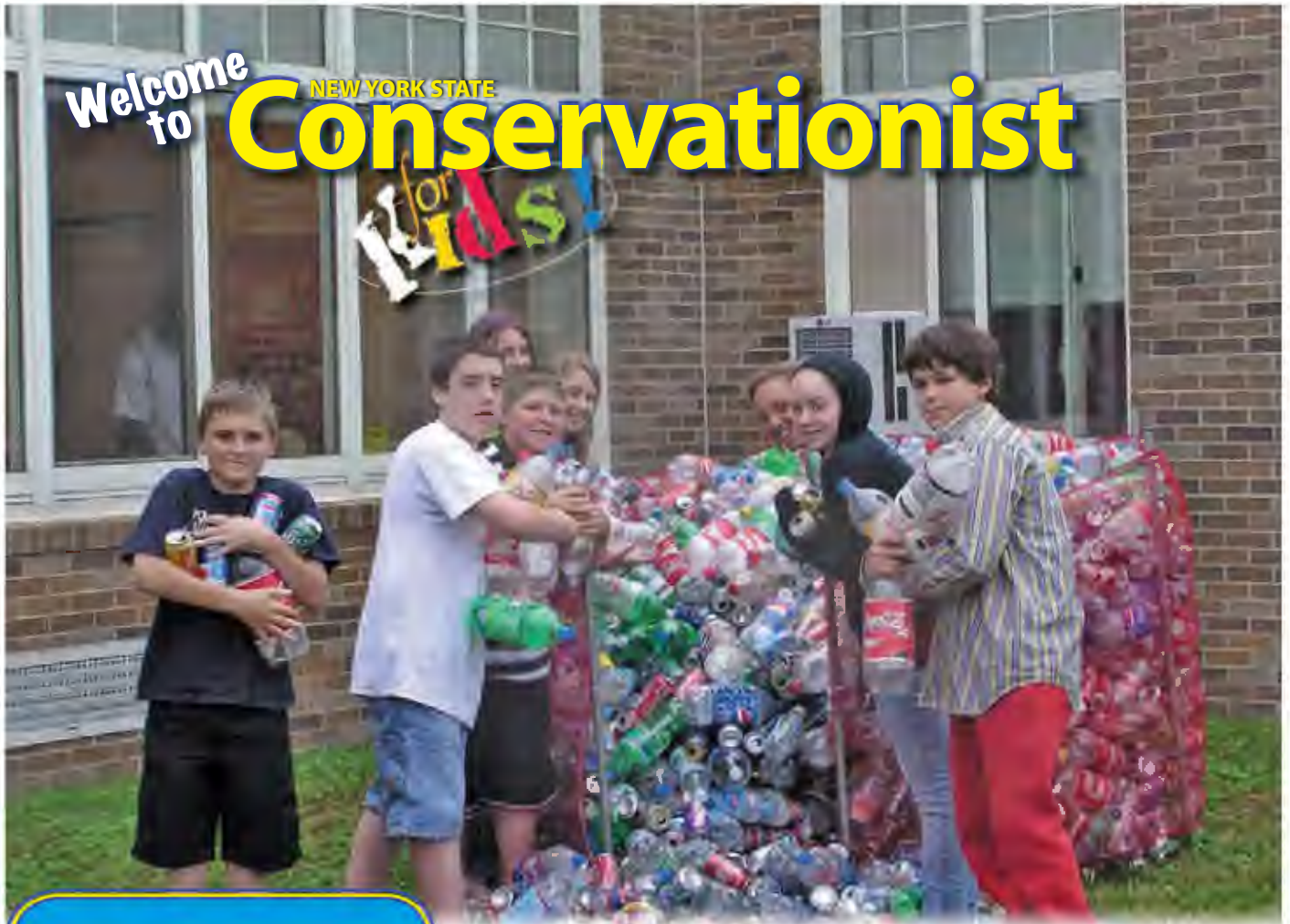
Bottle drives can be a good fund-raiser for your school.