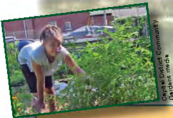
Capital District Community Gardens media