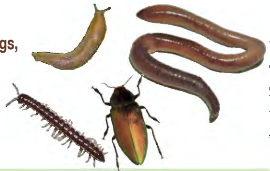
Common earthworm-Joseph Berger, Bugwood. Dusky slug-Gary Bemon, USDA APHIS, Bugwood.org Centipede-Gary Alpert, Harvard University, Bugwood.org

Besides bacteria and fungi , invertebrates such as mites, millipedes, beetles, sowbugs, earwigs, earthworms, slugs, and snails help break down the materials in the compost. All of them need oxygen and moisture to do their jobs effectively. Material in the composter should be piled loosely. If it's too compacted, air can't flow through. Too much water makes air flow difficult, too. Keep compost moist but not soaking wet.